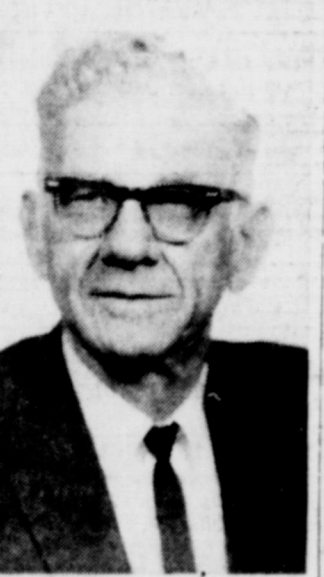
Mayor Frank Deaton

tion calls the bonds at the regular meeting Monday night, it will be in good shape to pay off the bonds on Oct. 15, and have a tidy sum left over. There's also about $1,000 in the sinking fund here, so the some $6,000 that has been associated with old debts will be freed for such needed item as a new fire truck, for instance. The city has one on order and the amount will just about pay for the basic chassis.