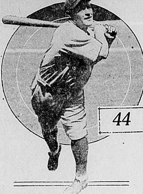
Hack Wilson of the Chicago Cubs, who has set a new National League home-run record and is now tied with Babe Ruth.