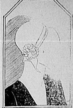
THERE IS an early, fall vogue of black with white accessories for town wear. This hat of white

SNYDER, Tex., Aug. 29.—Twen- ty minutes after shooting the