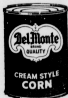
WK or CS—No. 303

VALUE PAC TISSUE 10-roll pkg. 69¢ DUTCH OVEN FLOUR 10-lb. bag 79¢ SNOWDRIFT SHORTENING 3-lb. can 59¢ SALAD DRESSING Kraft Salad Bowl... qt. 39¢ CHUNK TUNA Shamrock Reg. Can 4 for $1