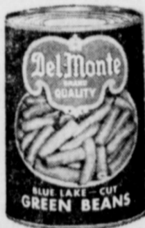
Del Monte Cut — No. 303