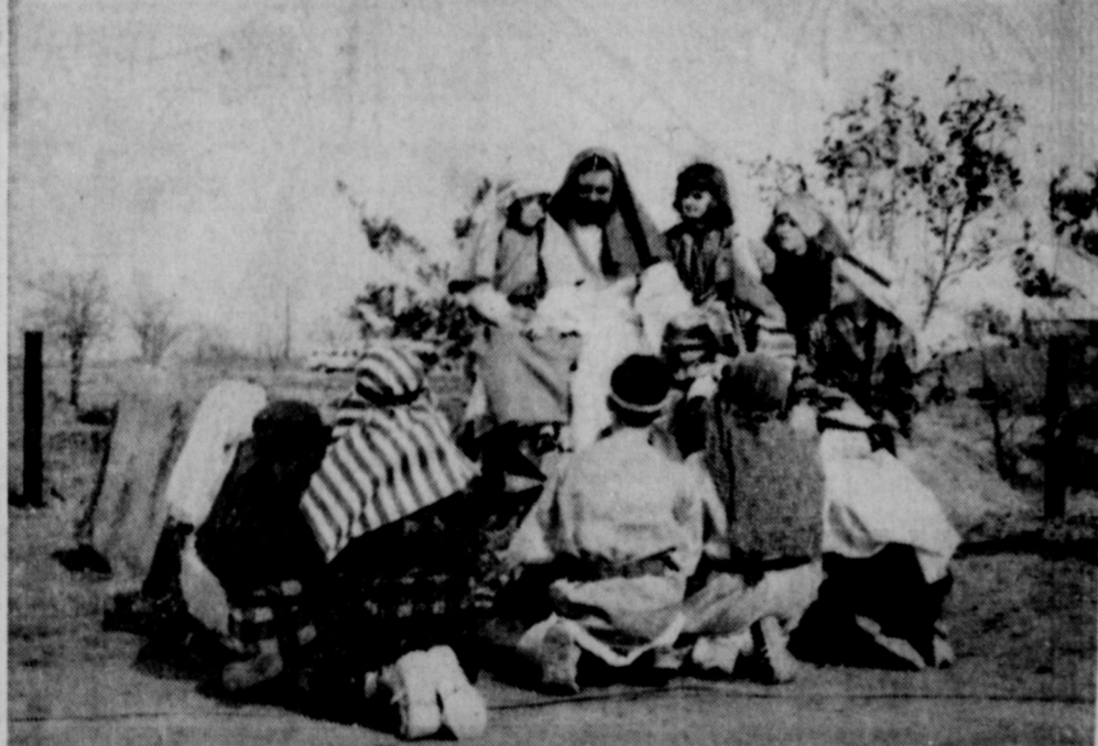
... suffer the little children ...