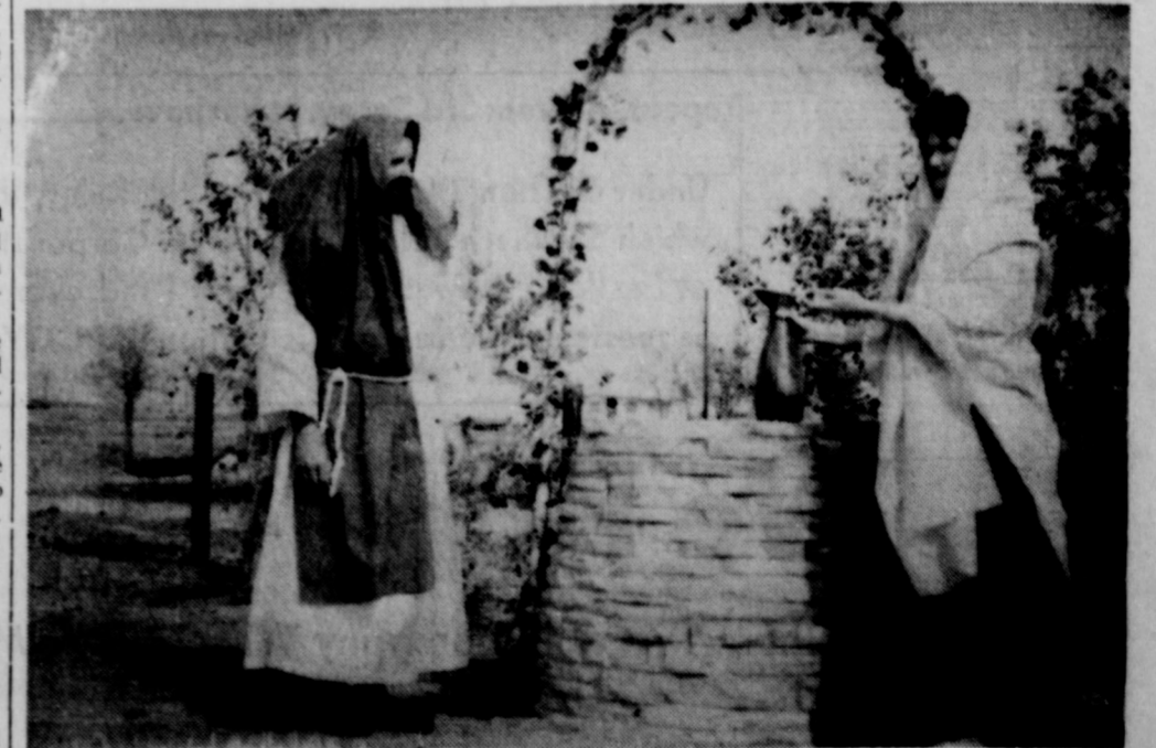
The Woman at the Well