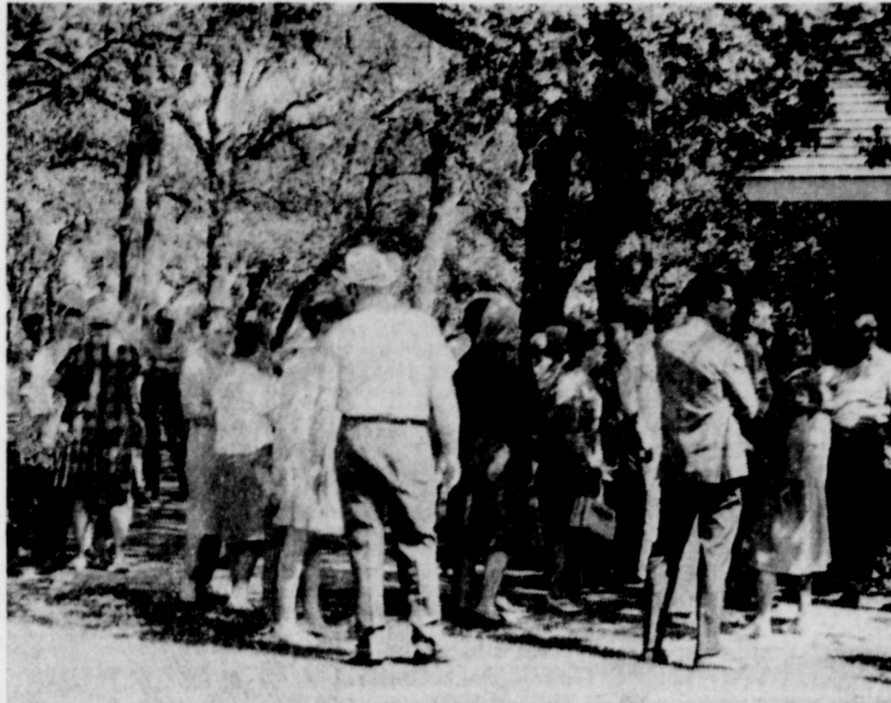
DURING THE TOUR OF KOKOMO Wednesday many friends and neighbors on hand to see the improvements that have been made in the community, last year. Kokomo did not win the state contest but did receive $350 for being in the top for communities in the state.