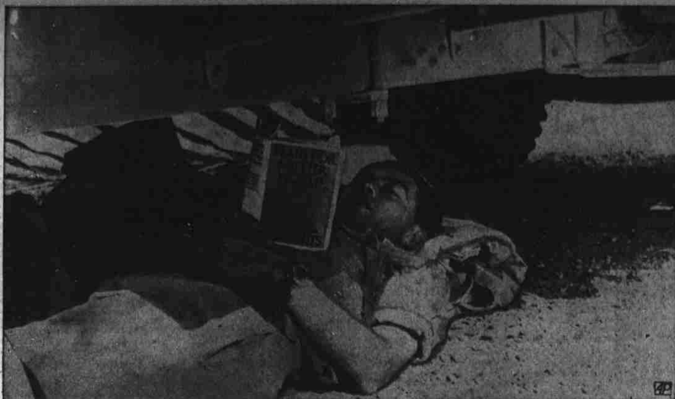
TIMELY READING—A British Eighth Army soldier lying under a truck in the Egyptian desert reads a book about the possibilities of the post-war world. He got the book from a mobile library. This is an official British picture.

(Big Spring's oldest Drug firm with the youngest drug) Cunningham & Phillips Petroleum Bldg. & 217 Main