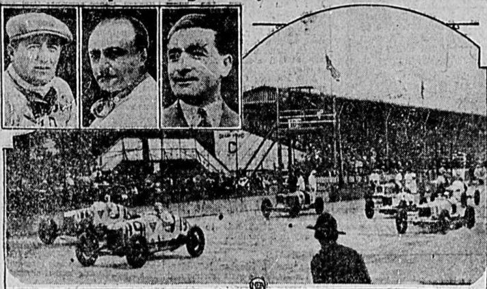
The pick of the country's race drivers are gathered at Indianapolis for the auto speed classic of the year...