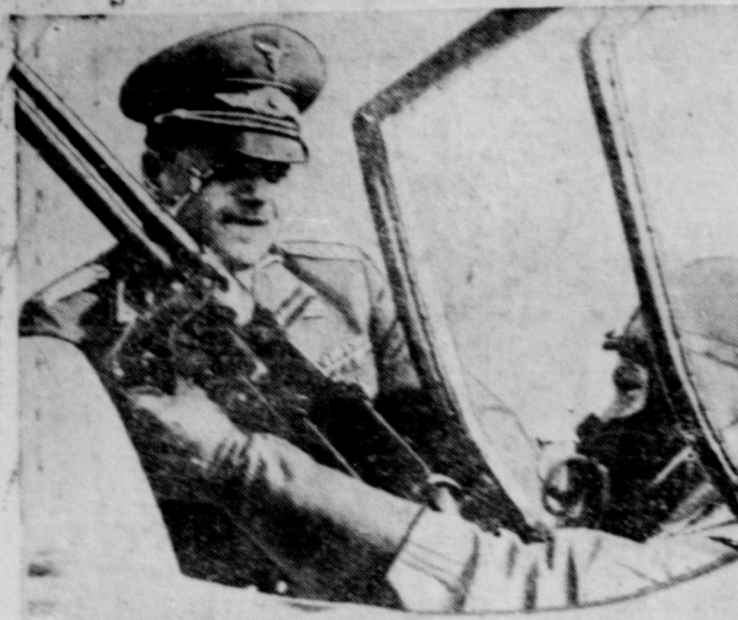
Grimly determined to prove the superiority of German air might over British sea power, Adolf Hitler and Marshal Goering are reported to have sent Gen. Erhard Milch, Nazi air ministry's secretary of state, to Norway with orders to "sink a battleship, come what may." General Milch, pictured, left, inspecting machine gun on Nazi bomber, is said by Germans to have fulfilled his mission with sinking of 30,600-ton British battleship of the Warspite class.