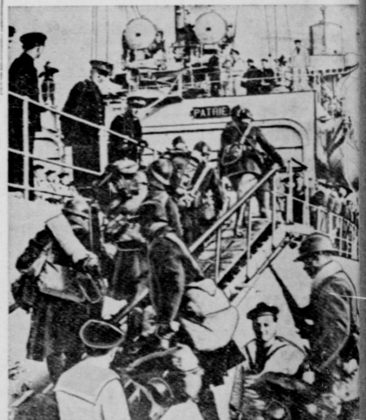
France's famed, hard-bitten Foreign Legionnaires board a troop transport, aptly named Patrie, from an undisclosed African port. Their destination: war.