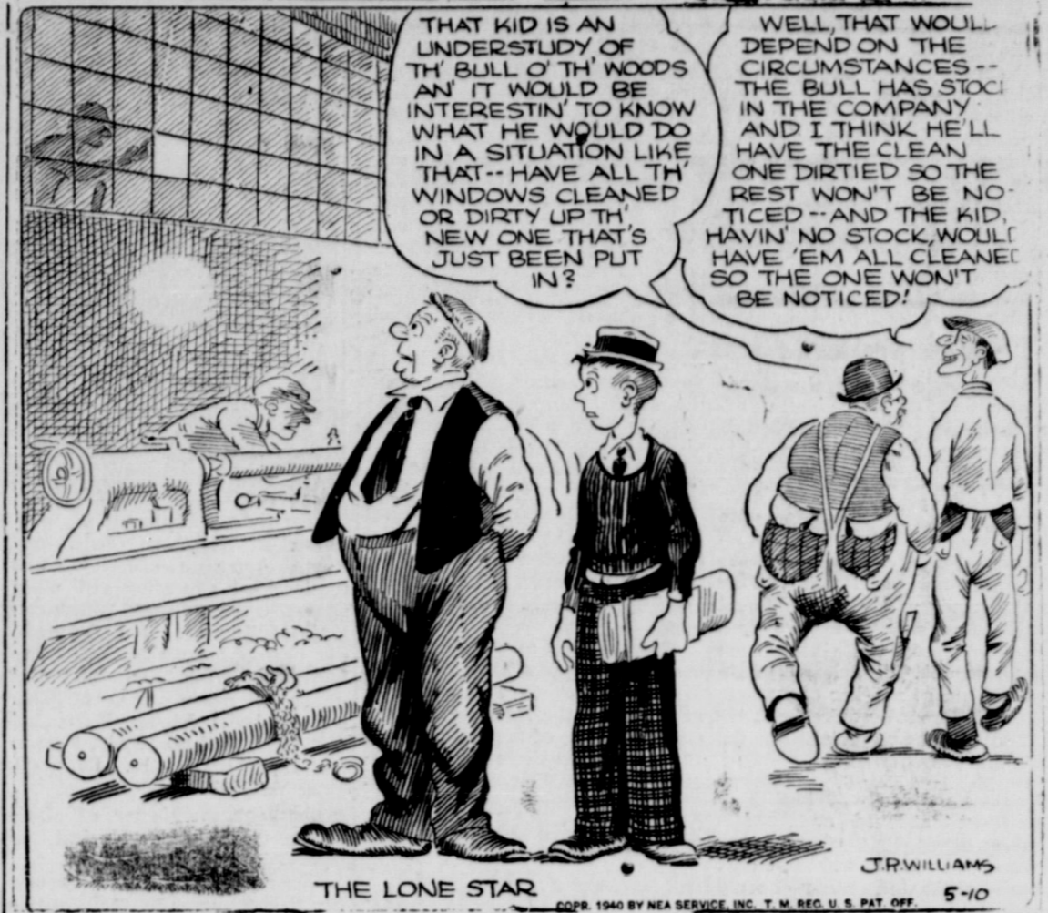
THE LONE STAR

COPY. 1940 BY NEA SERVICE, INC. T.M. REG. U.S. PAT. OFF. 5-10