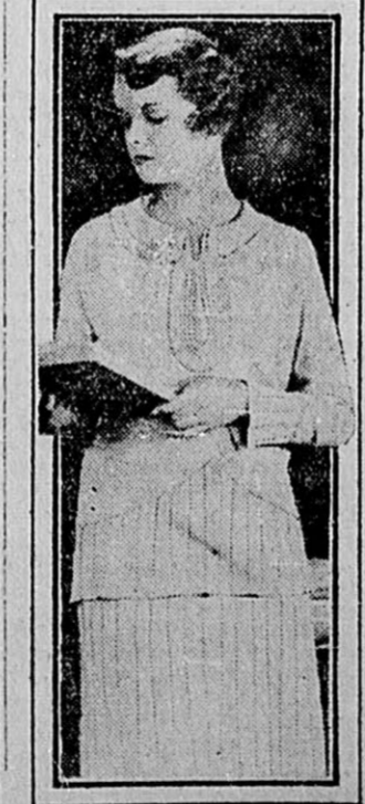
A peplum, cuffs and skirt of hand pleating distinguishes a beige flat crepe frock whose youthfulness and chic make it ideal for the use of the college girl.