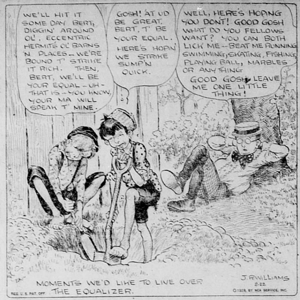
MOMENTS WE'D LIKE TO LIVE OVER THE EQUALIZER.

enthusiastic reports at the meeting today, and each department of the fair is expected to be a highly successful feature.