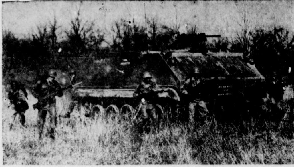
LIKE CAVALRYMEN OF OLD, modern day riflemen dismount from their steed—the Army's new M-59 armored personnel carrier—19 mop up the "enemy" and seize the objective at Fort Knox, Ky.