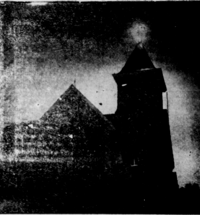
GUIDING LIGHT—The eight-foot neon cross atop the steeple of a Pittsburgh, Pa., church is not only a symbol of faith. The congregation of the Union Church erected the structure to warn low-flying planes approaching nearby Greater Pittsburgh Airport.