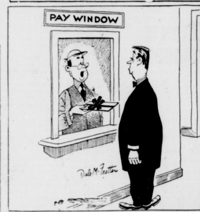
"The boss didn't exactly say you're lazy—he just said to gift-wrap your paycheck!"