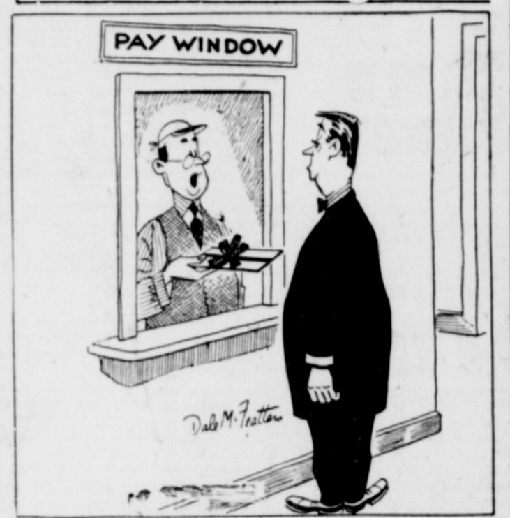
"The boss didn't exactly say you're lazy—he just said to gift-wrap your paycheck!"