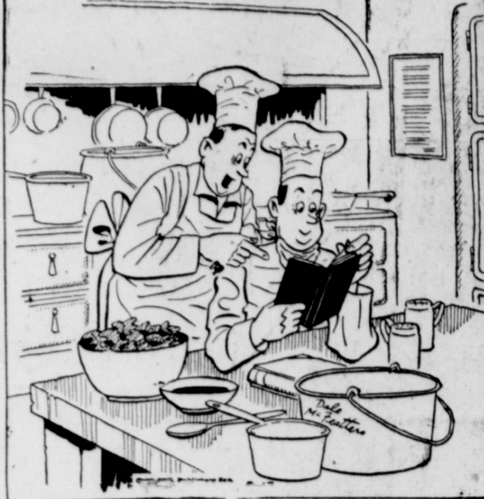
"There's a real dish-what's her phone number?"