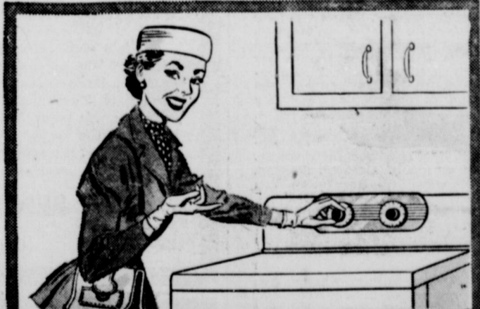
Clothes drying is just a two-minute job... the time it takes to load and set your automatic Electric Dryer