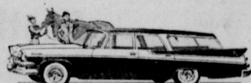
Now! Swept-Wing Wagons with the OBSERVATION LOUNGE

There it is — the Swept-Wing Dodge — 212 gleaming inches of sleekness and excitement! And the thrill you'll get once you actually take the wheel is something you'll never forget: The lusty surge of the new 310 hp. Super D-500 V-8 Engine . . . the dazzling breakaway of new Push-Button TorqueFlight . . . the complete mastery of the road with new Torsion-Aire Ride. All this is yours in a low-slung sweetheart of a car only 4 1/2 feet low. You have never seen, felt, owned anything like it.