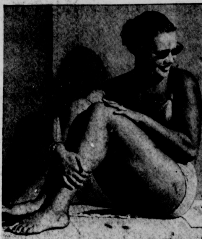
BALMY DAYS IN RUSSIA —Yes, this is Russia. Looking more like Miami Beach than the frozen wastes usually pictured, the bright sunshine complements this shapely ballet starlet from Moscow. She belongs to members of the privileged class who can afford an expensive holiday at Sochi, a fashionable Black Sea resort. The photograph is from a recent issue of Look magazine.