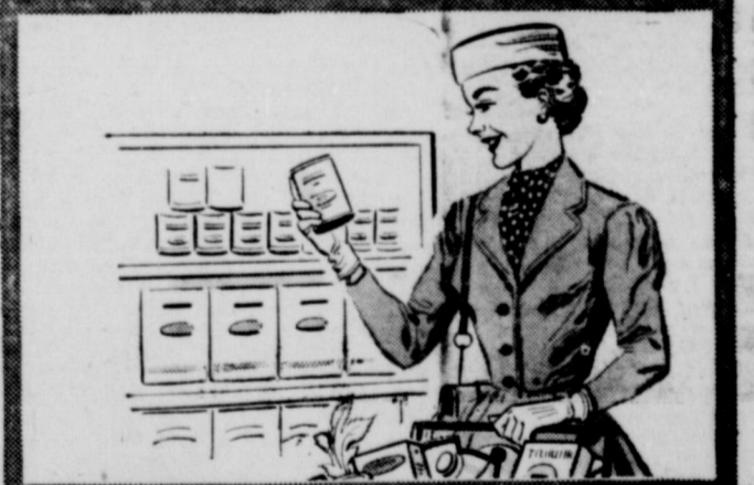
No more hanging out and taking in wash. You can do other things while your clothes dry electrically

You can fit washdays into any schedule you choose when you have an Electric Dryer. ... you can dry clothes any time you have the time. Night or day, rain or shine, you just put in freshly washed clothes... set the controls... the dryer does the rest. And you'll find that less time is needed for ironing. Don't be a slave to washday routine... dry your clothes the modern way. It's one of the nicest things about living better... electrically!