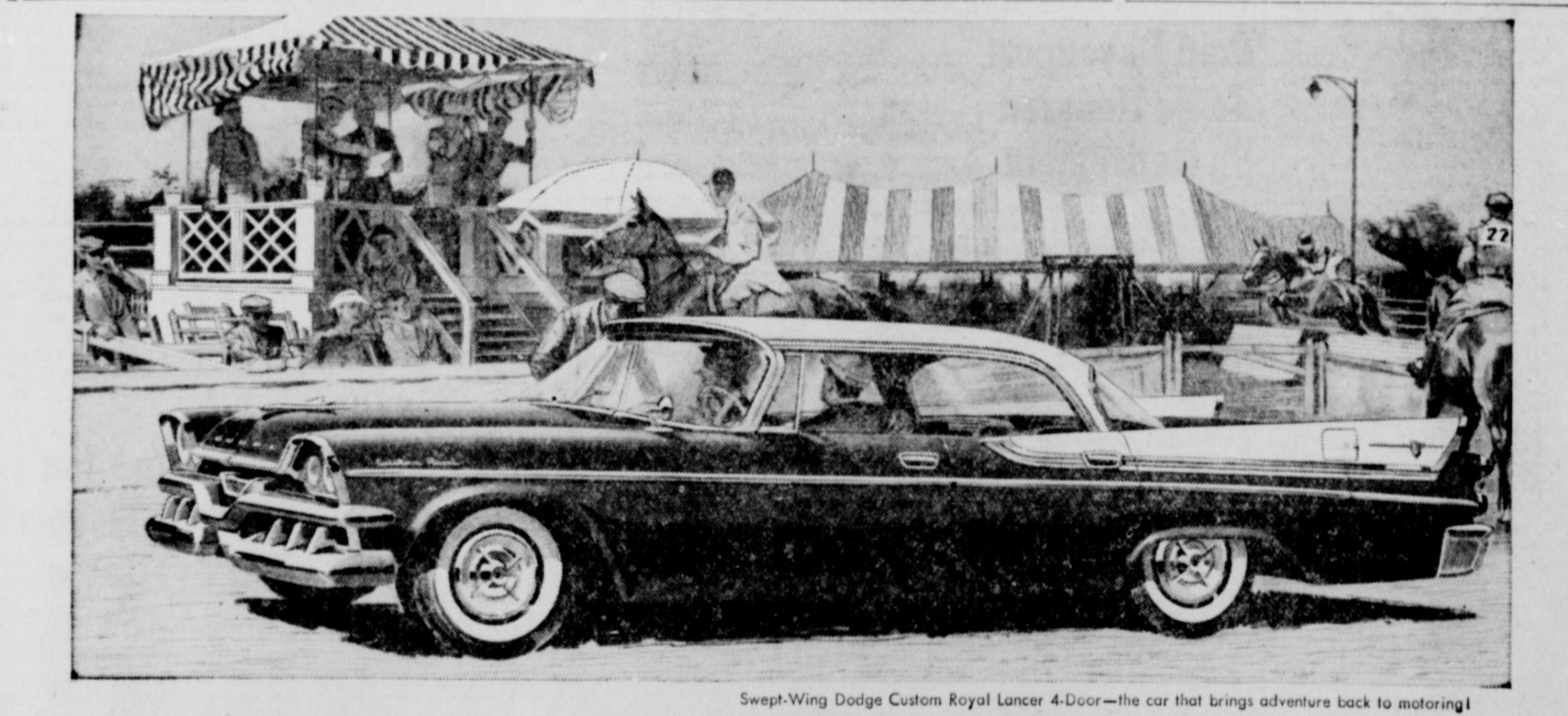
Swept-Wing Dodge Custom Royal Lancer 4-Door—the car that brings adventure back to motoring!