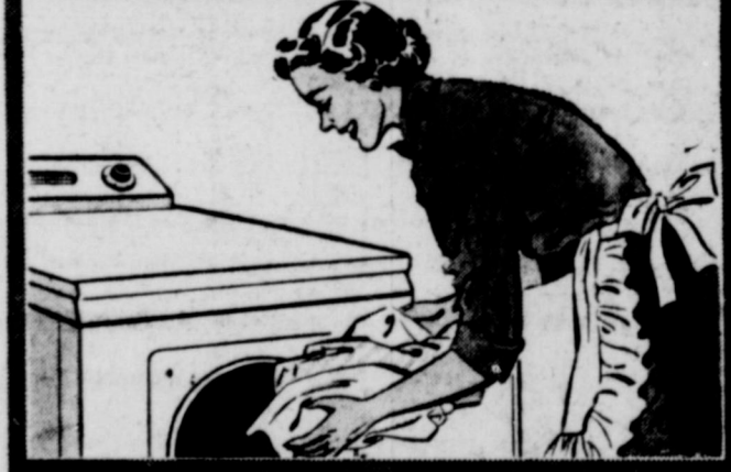
For others, you just set the controls for damp dry, just right for easier ironing. No sprinkling needed

Gentle electric clothes drying shortens ironing time because electrically-dried clothes have fewer wrinkles and no clothespin "ears" to iron out. Many fabrics such as towels, corduroys and knit goods come from your Electric Dryer so wrinkle-free they require no ironing at all. And, of course, you free yourself from monotonous clothesline drudgery when you dry clothes electrically. Your time-saving, work-saving Electric Dryer is economical, too, because it protects clothes while it dries them.