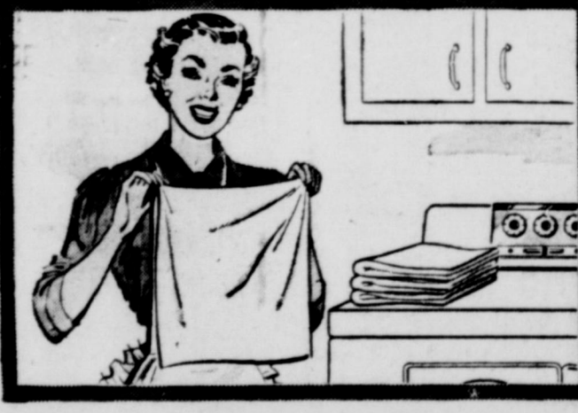
Many things come out of your dryer so fluffy-smooth, they need only folding before you put them away