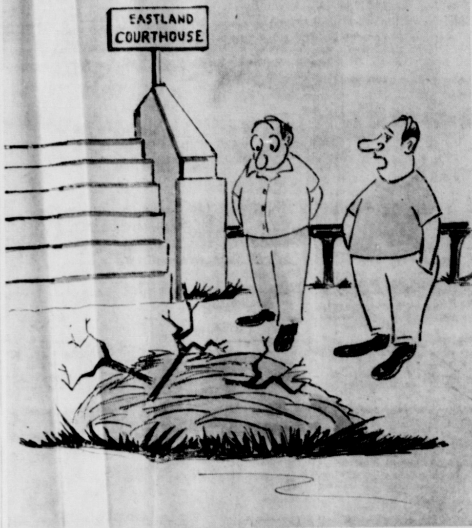
"Some new landscaping scheme?" . . . by Bob Phillips

EASTLAND AUTO PARTS 300 S. Seaman MAIn 9-2158