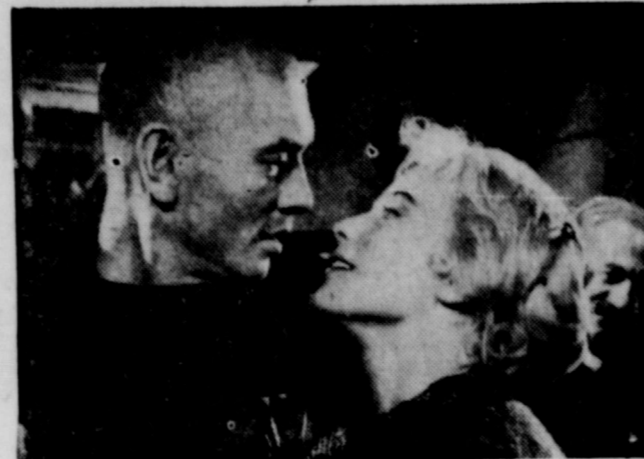
YUL BRYNNER and MARIA SCHELL in romantic scene from MGM's dramatic smash hit "THE BROTHERS KARAMAZOV" in Metrocolor.