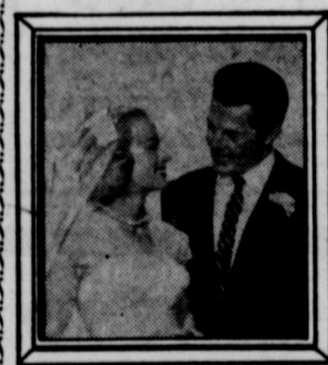
Don't fail to include a wedding portrait in your plans for this once in a life-time occasion.

Man's God-given dominion over fear and limitation will be set forth at Christian Science services Sunday. Reading in the Lesson-Sermon entitled "Adam and Fallen Man" will include the following from Palms (37:55, 29): "Commit thy way unto the Lord; trust also in him; and he shall bring it to pass . . . The righteous shall inherit the land, and dwell therein for ever." Selections to be read from "Science and Health with Key to the Scriptures" by Mary Baker Eddy include the following (316:20): "Christ presents the indestructible man, whom Spirit creates, constitutes, and governs. Christ illustrates that blending with God, his divine Principle, which gives man dominion over all the earth." The Golden Text is from Galatians (6:3): "If a man think himself to be something, when he is nothing, he deceiveth himself."