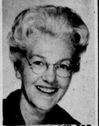
"I COULDN'T ASK FOR BETTER CARE. I'M GLAD I CAME"