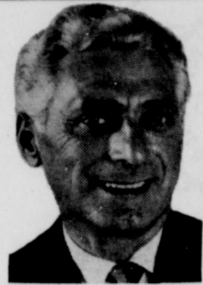
"IT'S A GREAT PLACE TO LIVE"

It Cost No More To Enjoy The Finest! Accepting Residents Now MEMBER