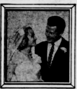
Don't fail to include a wedding portrait in your plans for this once in a life-time occasion.