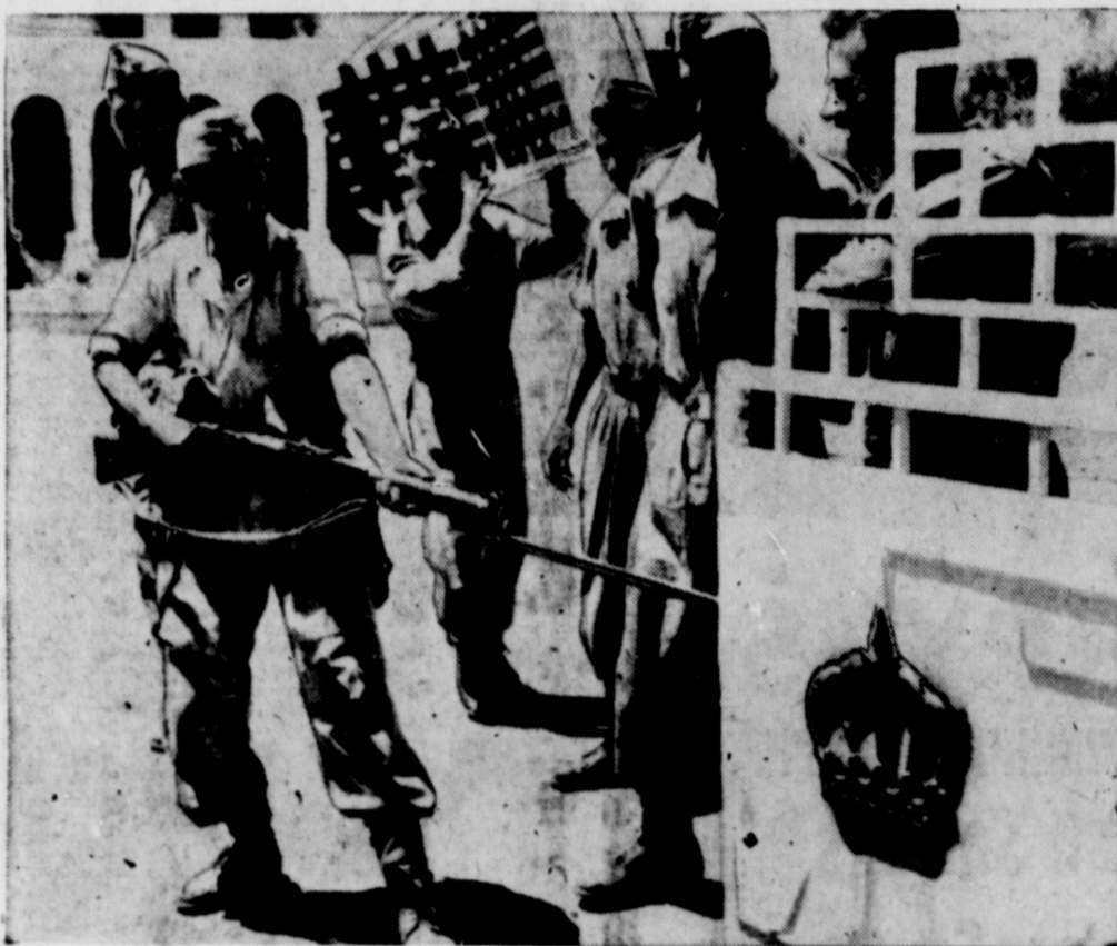
THEY LAUGH AT THE CROWN—An Iraqi soldier points his bayoneted rifle at a crown on the wall of the late King Faisal's palace in Baghdad. His laughing comrades in arms appreciate the grim jesture. Not far from here, Faisal was machine-gunned to death when the army-led coup took the country with sudden violence.