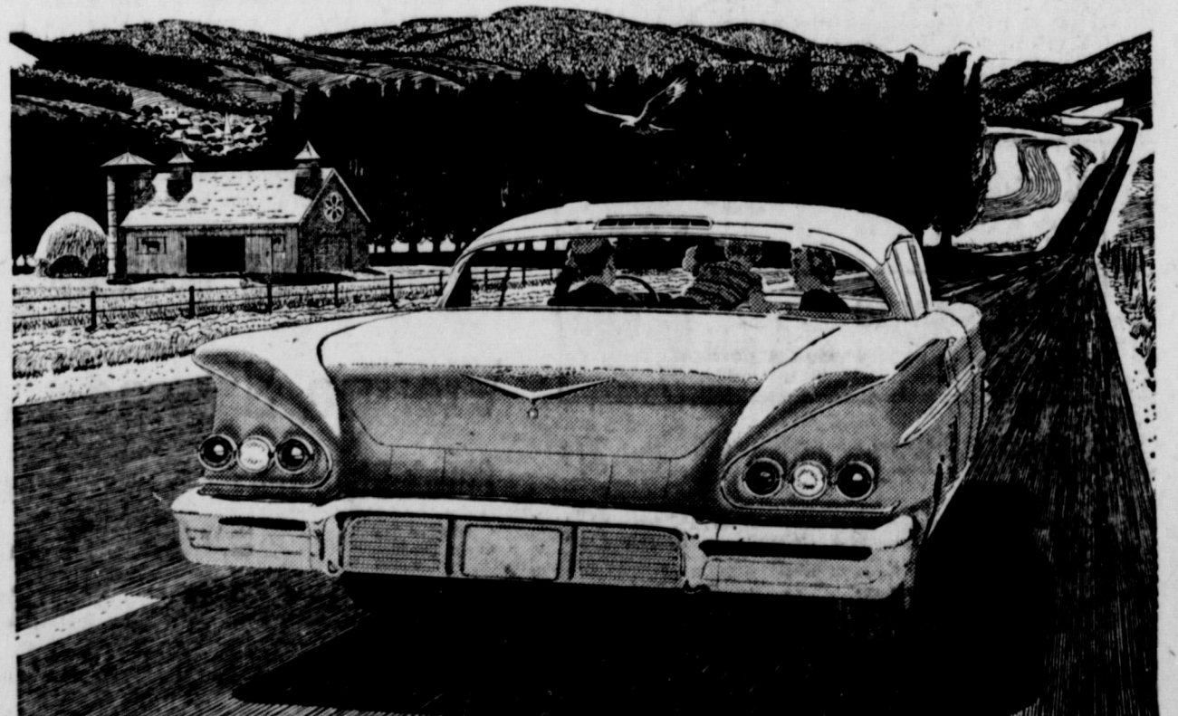
See the Chevy Show, Sunday night on NBC-TV and the weekly Chevy Showroom on ABC-TV. Impala Sport Coupe with Body by Fisher.

America's best buy— CHEVROLET America's best seller!