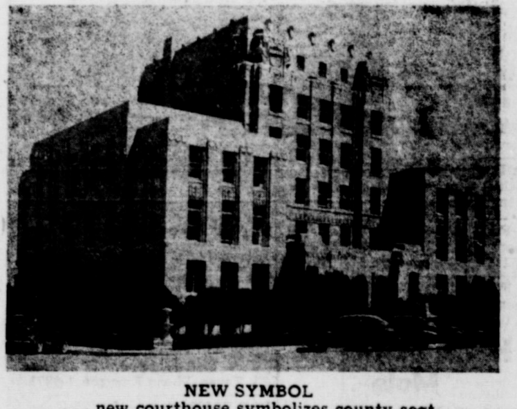
NEW SYMBOL ... new courthouse symbolizes county seat

That will mean that a filtration unit will have to be installed to process lake water which will be used for drinking purposes in the clubhouse.