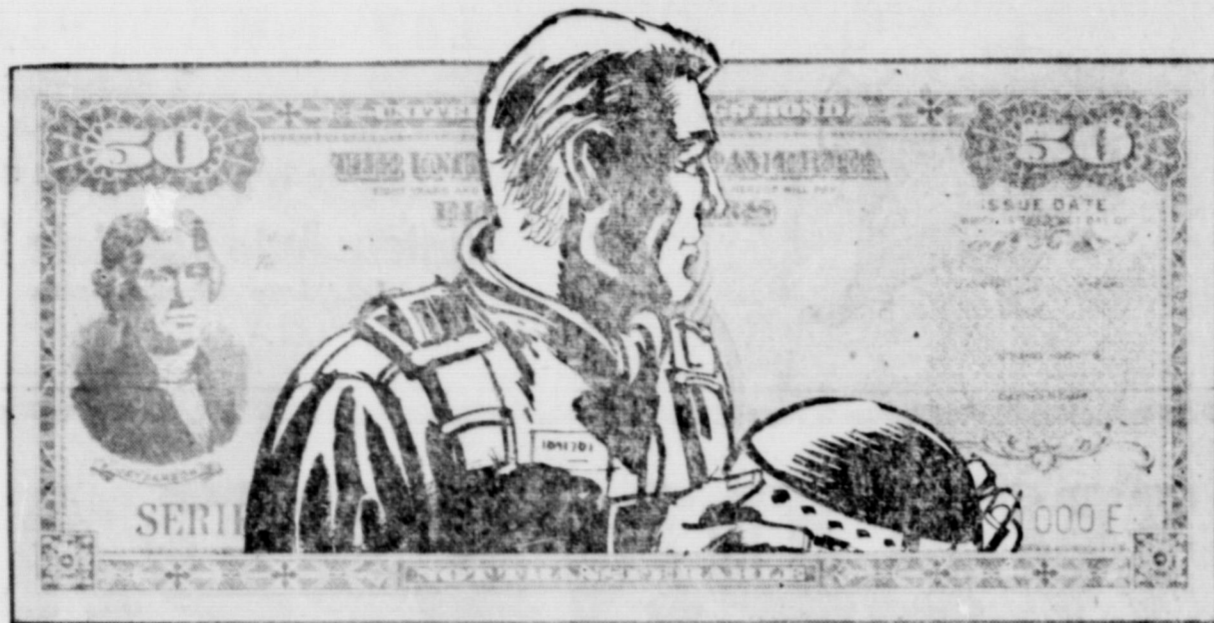
It takes money to keep our jet pilots up there patrolling the skies. . . .