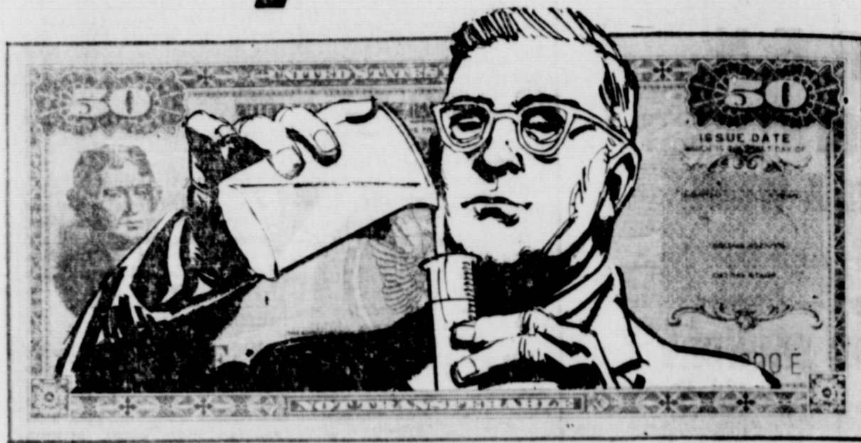
Money to let our scientists continue their search for answers. . . .