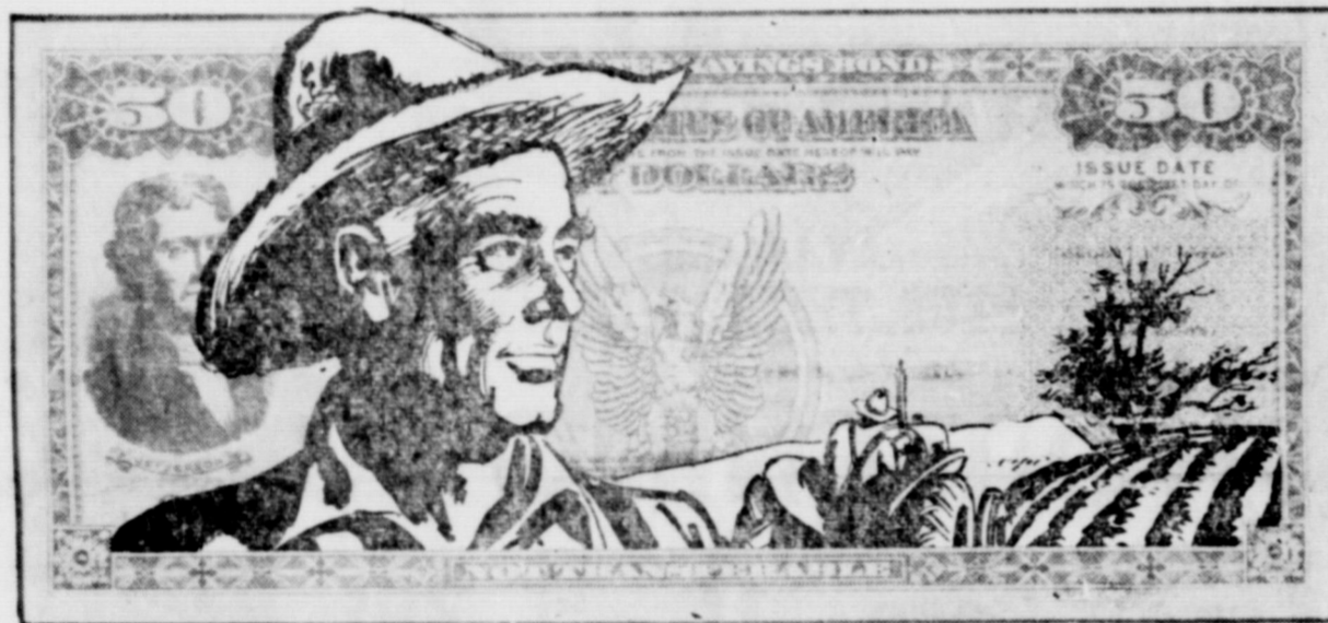
Money to insure that our productive power will thrive and grow. . . .