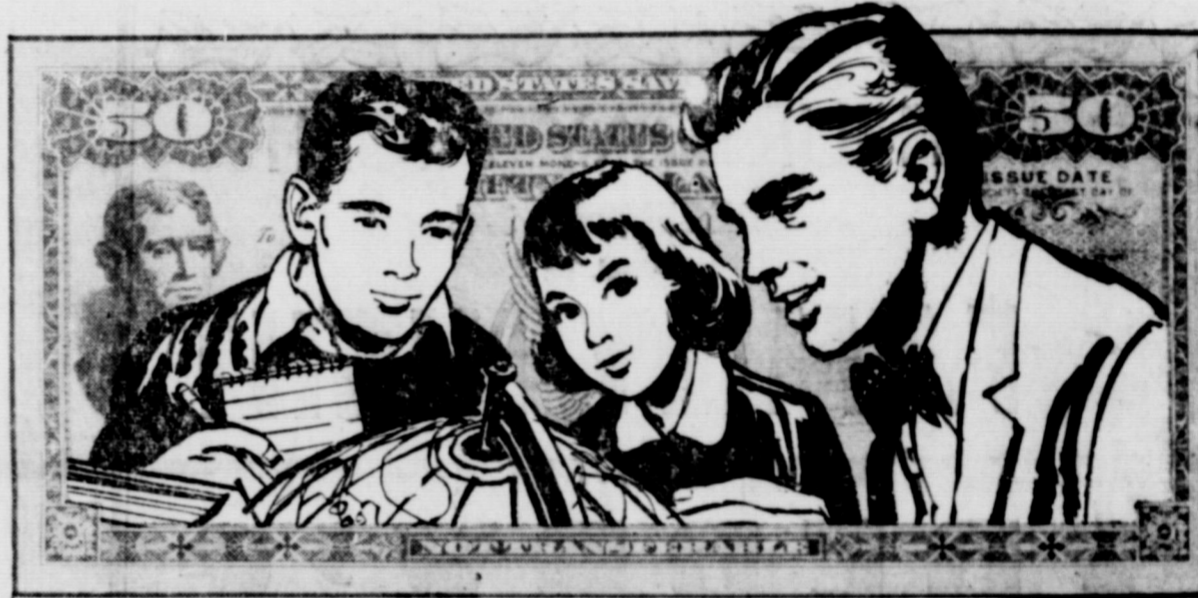
Money to help our children learn how to make peace lasting.

Yes; peace costs money. Money for research and schools and military preparedness. Money saved by individuals to keep our economy strong.