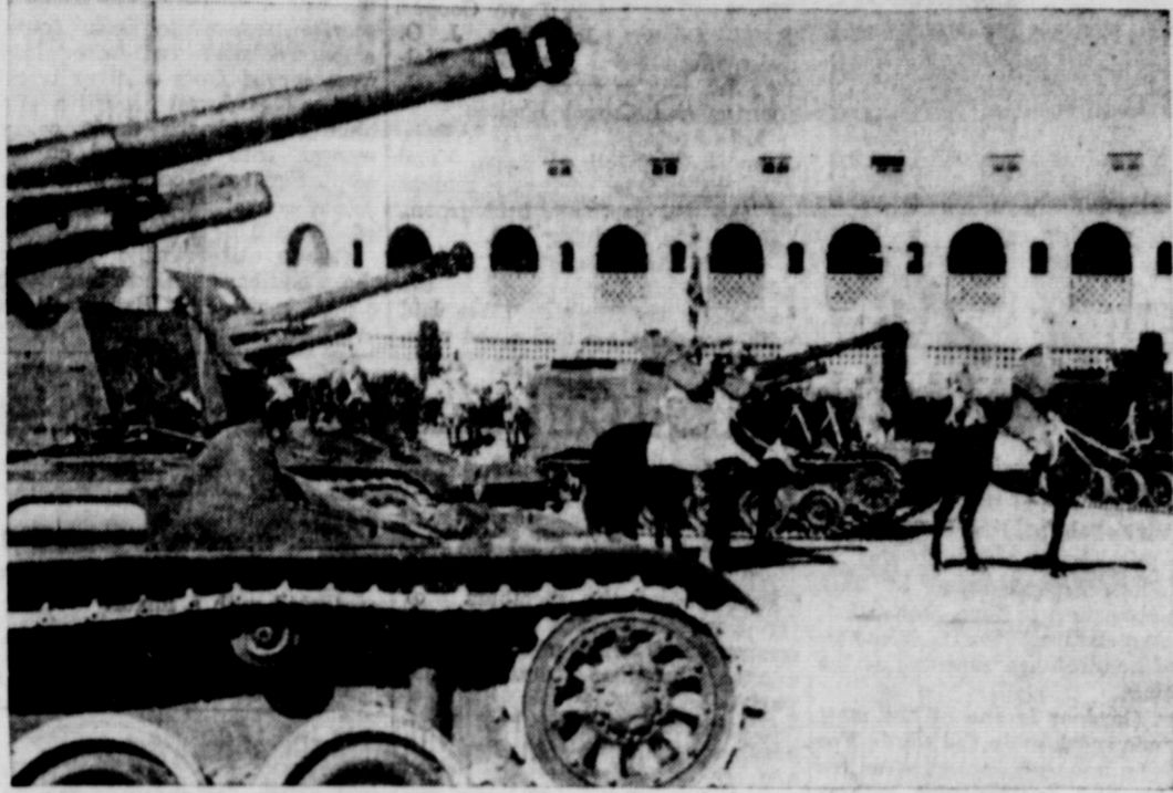
MANY HAPPY RETURNS —Unique in the realm of presents are these four 105 mm. mobile guns presented by French President Charles de Gaulle to Morocco's King Mohammed V. The guns, which are destined for the Moroccan army, stand in Rabat during ceremonies honoring the king on the 32nd anniversary of his coronation.