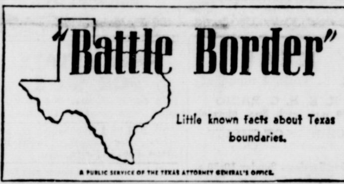
Little known facts about Texas boundaries.

EASTLAND NATIONAL BANK "On The Square" MEMBER F. D. I. C.