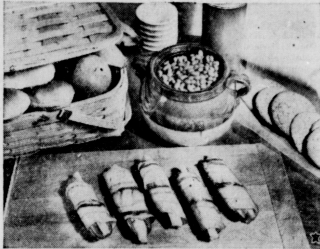
Easy-to-fix foods make the best choice for picnic menus. For your next picnic or beach party, have stuffed frankfurters, baked beans, relishes, fruit and cookies . . . they're easy to pack and easy to serve.

Frankfurters have been said to have originated in Germany but is there anything quite so American as a bun wrapped around a juicy, sizzling hot dog which has been generously covered with relishes? Each year, picnickers still seem to rate frankfurters first or second on their list of favorite picnic foods. Why? Probably because in addition to tasting good they're easy to pack and easy to cook and serve. Since frankfurters are completely cooked, ready to eat, they need only to be heated through if you like to roast them for eating hot, comments Reba Staggs, meat expert. Picnic time is right now so perhaps you'd like a few frank-