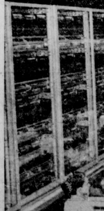
FOOD FOR THOUGHT —Girls seated at mail-sorting keyboards are the "cooks" in this automat-like mail sorting device in the Washington, D.C., post office. Each girl can handle nearly 18,000 letters a day. Once letter is coded for distribution by the Belgian-made device, it's automatically pigeon-holed for distribution to delivering offices.