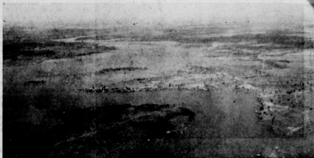
LAKE LEON—From the air, flying near the dam, looks like this. A slight tilting of the airplane at the time this picture was taken prevented the dam from showing here. Private and commercial docks can be seen on both sides of the lake, along with a number of roads. The lake is backed up for a considerable distance beyond the dam, as can be seen here.