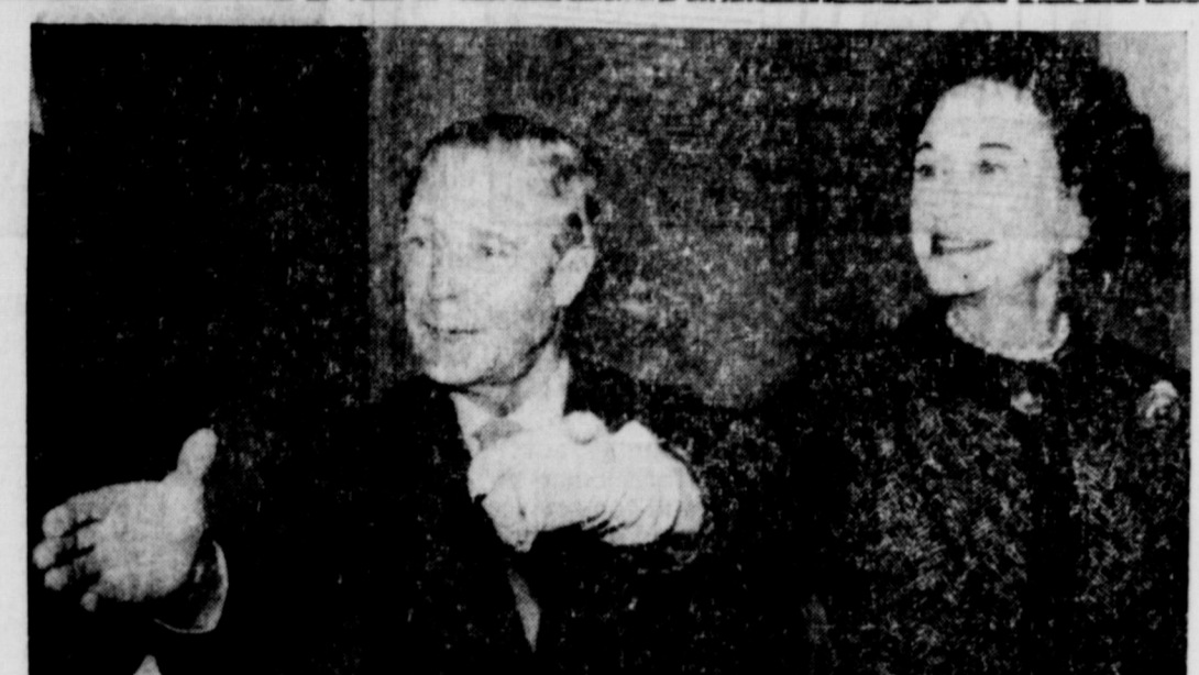
WINDSOR'S THE NAME —The Duke and Duchess of Windsor, arriving for a stay in New York, extend glad-hands simultaneously to newcomers.