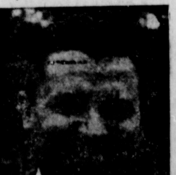
RALPH W. YARBOROUGH Wins Senate Race