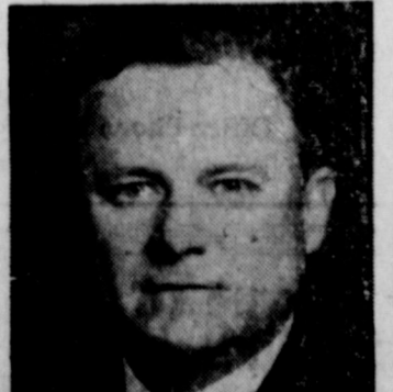
PRICE DANIEL to serve second term