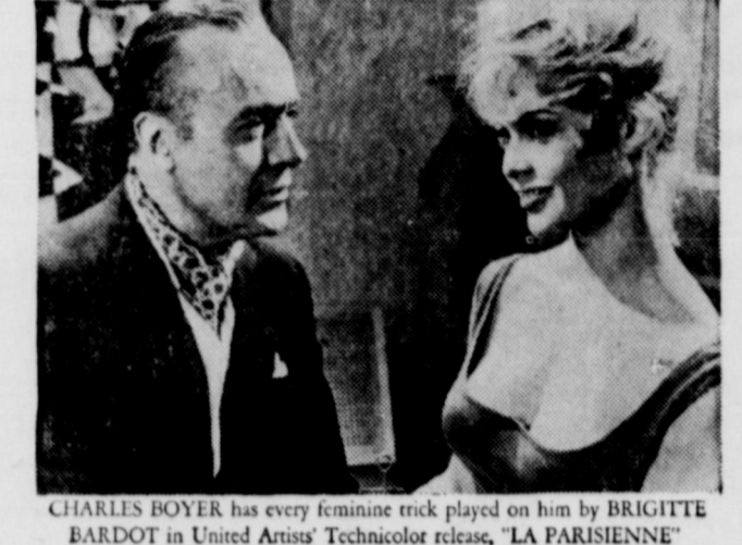
CHARLES BOYER has every feminine trick played on him by BRIGITTE BARDOT in United Artists' Technicolor release, "LA PARISIENNE"