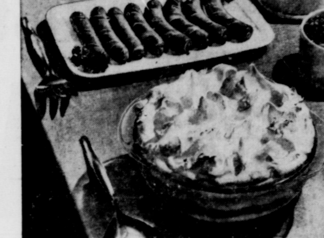
Here's a luscious and dressy dessert teens will enjoy. It's a combination of vanilla pudding layered alternately with fresh juicy orange sections, vanilla wafer crumbs and flaked coconut.

Coconut Orange Meringue Pudding 1 package vanilla pudding and pie filling mix 2 cups milk 2 egg yolks 1 1/2 cups flaked coconut 1 cup vanilla wafer crumbs 1 1/2 cup orange sections 2 egg whites 4 tablespoons sugar