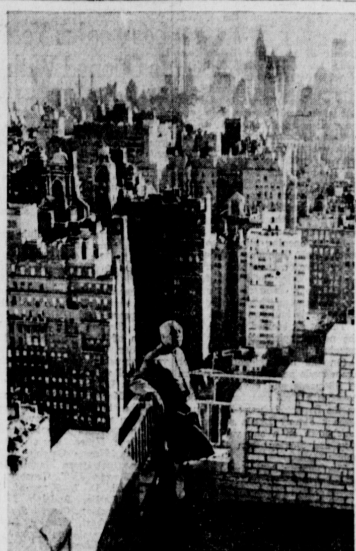
MAN IN THE CENTER —Indian Prime Minister Jawaharlal Nehru relaxes on the balcony of his New York hotel suite. He is a leader in the U.N. neutral nations' bloc attempting to oil East-West friction.