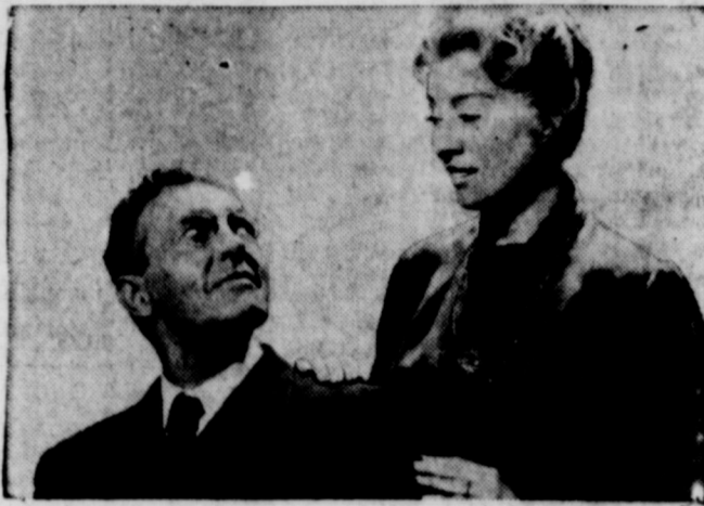
RALPH BELLAMY and GREER GARSON in a tender moment from Warner Bros. "SUNRISE at CAMPOBELLO," in Technicolor