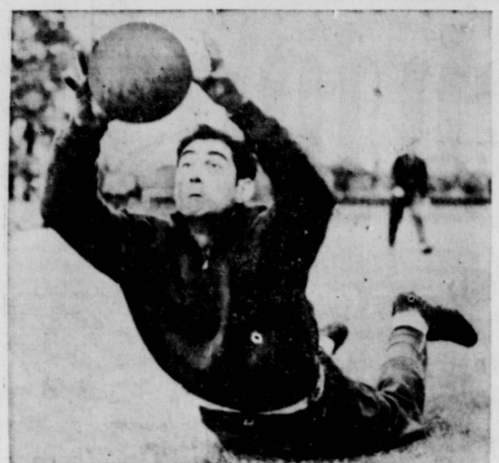
HE MADE THE SAVE —His eyes glued on the ball, Spanish goalkeeper Ramaletto heads for the turf at a London, England, soccer practice.

Suite 210 — Village Hotel Don Pierson - MA 9-1033 Norman Guess - MA 9-1545