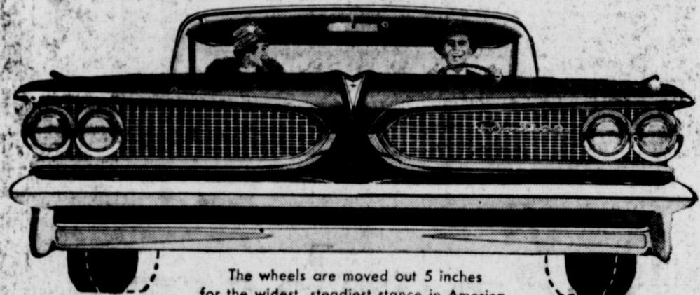
The wheels are moved out 5 inches for the widest, steadiest stance in America.

No "narrow-gauge" car hugs the road like PONTIAC!