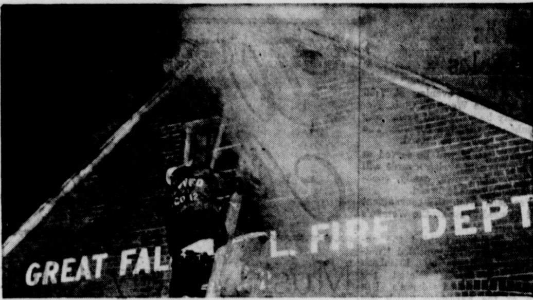
HOMEWORK —See what volunteer firemen cooked up for themselves on a defective hot plate in their headquarters at Forestville, Va. No injuries, but several cases of acute embarrassment were suffered.