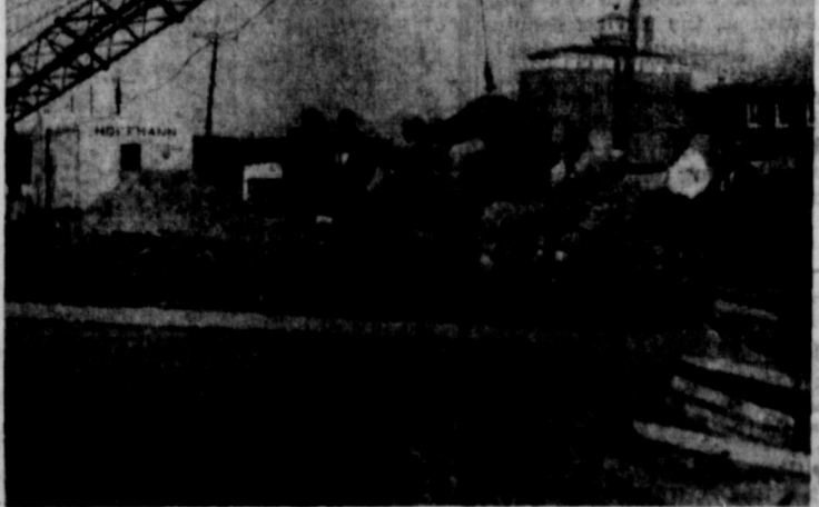
THE EASTLAND WAY —In typical Eastland fashion these volunteers are shown pouring the slab foundation for the new wing at Eastland Memorial Hospital. Eighteen more beds will be available at the hospital when the wing is complete. (Telegram Staff Photo).

The new wing will add a total of 18 beds, making the listed capacity of the hospital 43 beds.