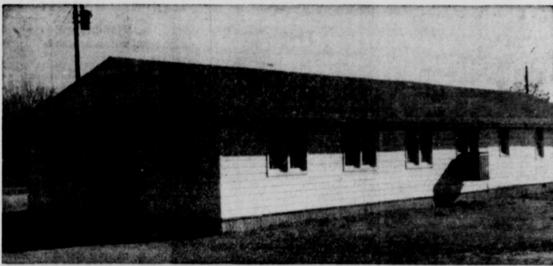
CALVARY BAPTIST CHURCH —The Calvary Baptist Church was organized five years ago this week, March 24, 1954, and work was immediately begun on the building pictured above. The church property is valued at $10,000 and there are 84 resident members of the church. (Telegram Staff Photo).