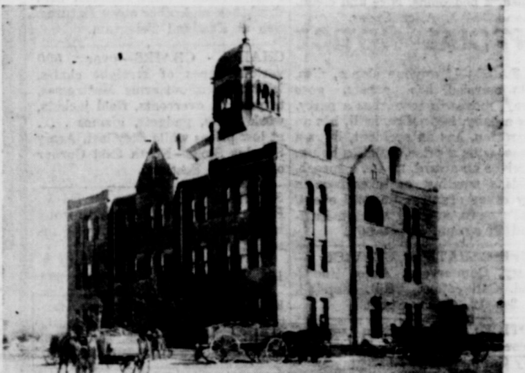
PAID IN FULL —Pictured above are the present Eastland County courthouse and the old courthouse. Final payment of the new courthouse (top) was made this week. The County therefore has a paid-for courthouse for the first time since the old courthouse was built in 1897.