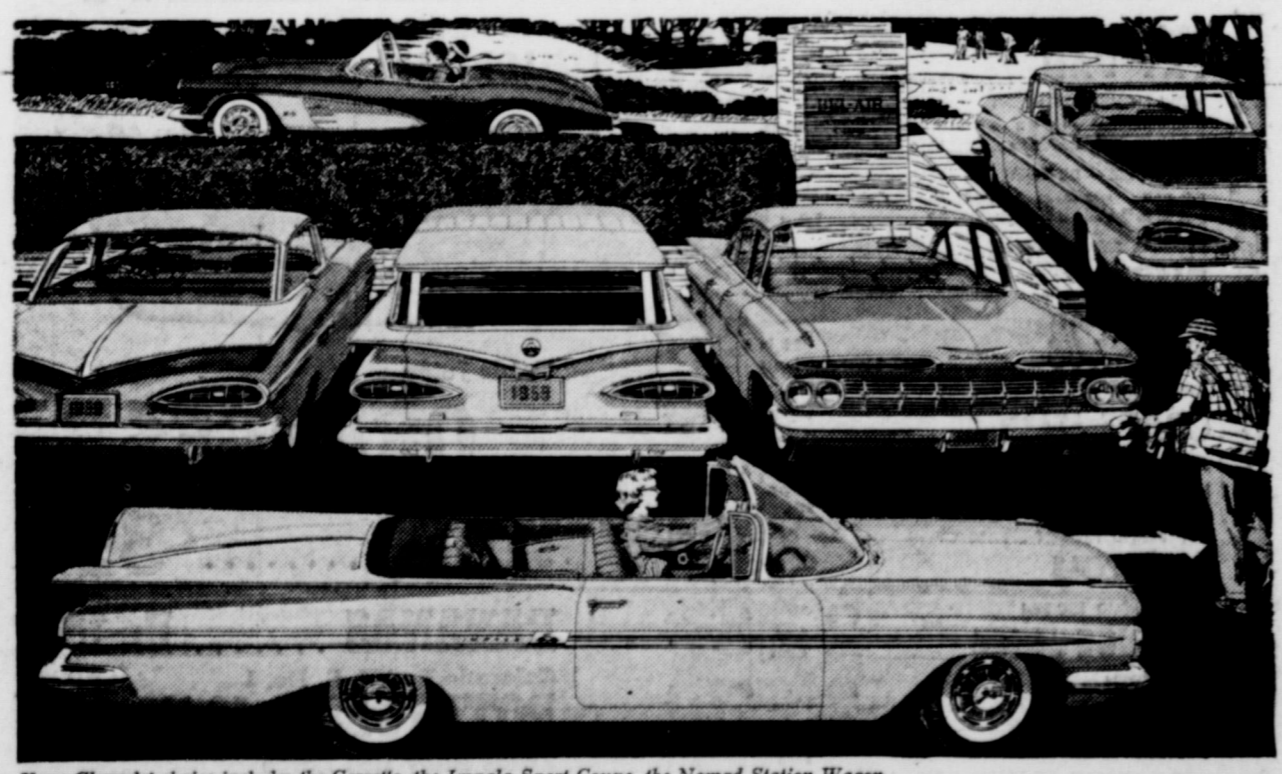
Your Chevrolet choice includes the Corvettes, the Impala Sport Coupe, the Nomad Station Wagon, the Bel Air 4-Door Sedan, El Camino, and the Impala Convertible — all shown above.

now — see the wider selection of models at your local authorized Chevrolet dealer's!