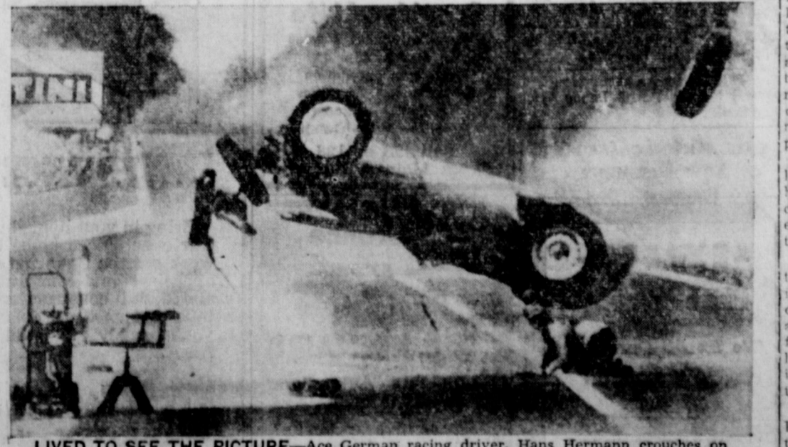
LIVED TO SEE THE PICTURE —Ace German racing driver, Hans Hermann crouches on the pavement as his racing car hurtles through the air in the West Berlin Grand Prix race. He was only slightly injured, but in a preliminary race the day before, French racing great Jean Behra was killed.

EASTLAND NATIONAL BANK "On The Square" MEMBER F. D. I. C.