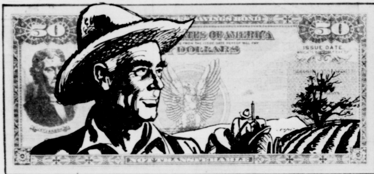
Money to insure that our productive power will thrive and grow. . . .