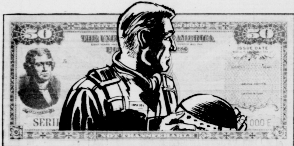
It takes money to keep our jet pilots up there patrolling the skies. . . .