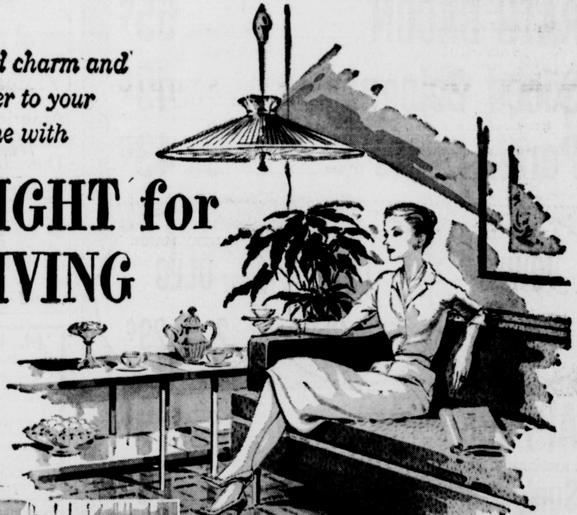
LIGHT FOR LIVING brings out the beauty of rugs, drapes and furniture... makes your home more living and attractive.