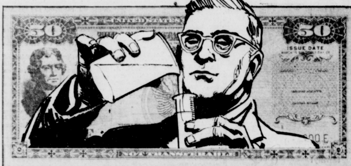
Money to let our scientists continue their search for answers. . . .