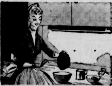
LIGHT FOR LIVING brings your work out of the shadows... makes seeing easier for all household tasks.

Light for Living is planned lighting, designed to make seeing easier and living more enjoyable in every room in the home. Light for Living can make rooms appear larger and more attractive... enhance the loveliness of your furnishings... eliminate gloom and harsh shadows... make your home brighter, cheerier, more pleasant. With portable lamps, wall lighting and overhead fixtures properly placed, it's easy to light your home both for beauty and eye comfort. Your favorite dealer will gladly help you select the lighting equipment you need to enjoy beautiful, efficient Light for Living. See him about it soon.