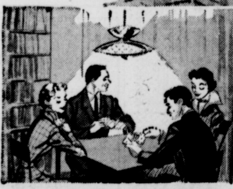
LIGHT FOR LIVING creates a happy atmosphere for games and other activities... makes evenings at home more enjoyable.