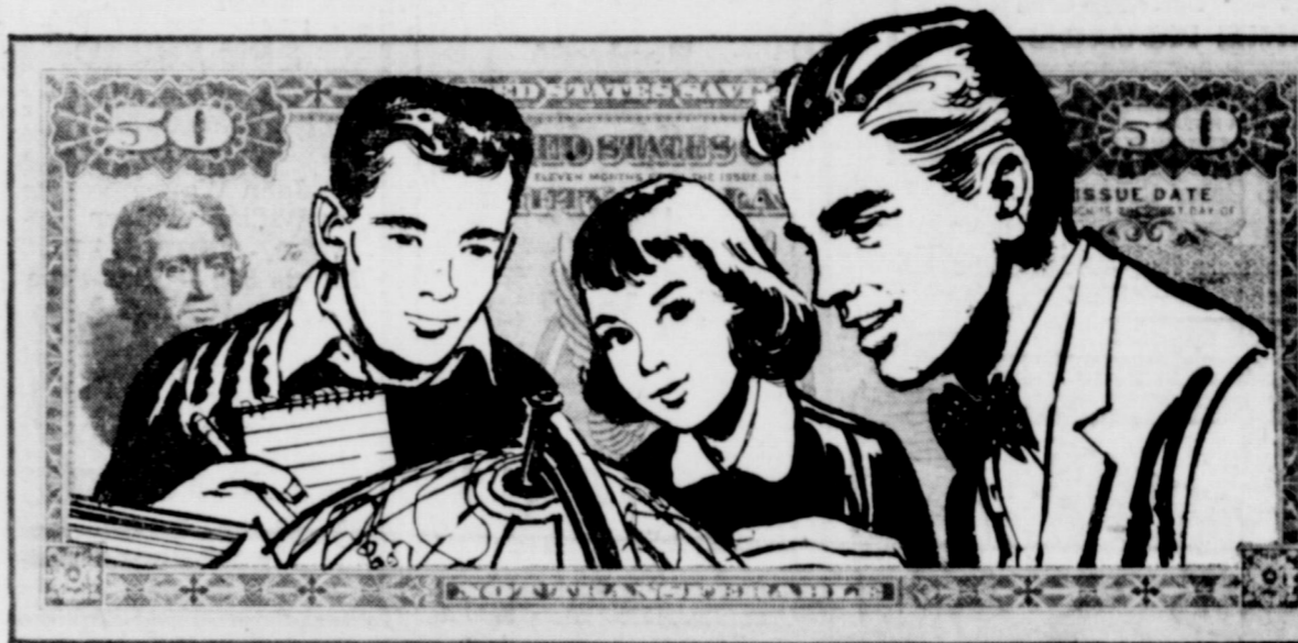
Money to help our children learn how to make peace lasting.

Yes; peace costs money. Money for research and schools and military preparedness. Money saved by individuals to keep our economy strong.