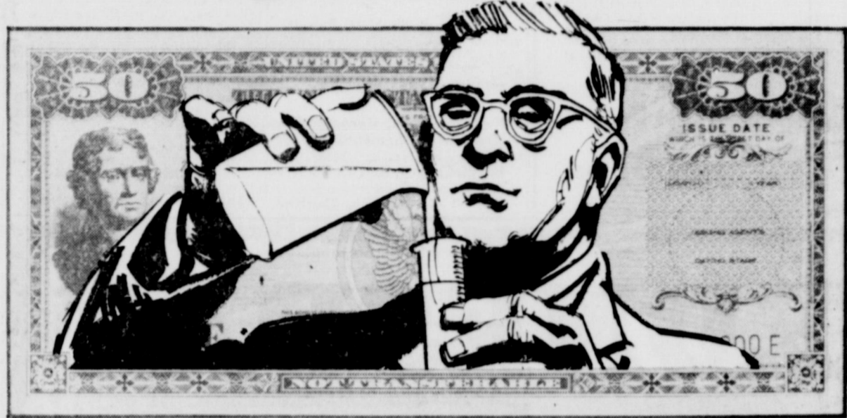
Money to let our scientists continue their search for answers. . . .