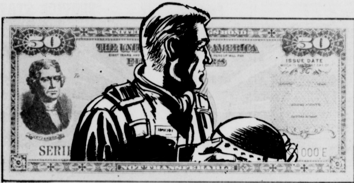
It takes money to keep our jet pilots up there patrolling the skies. . . .