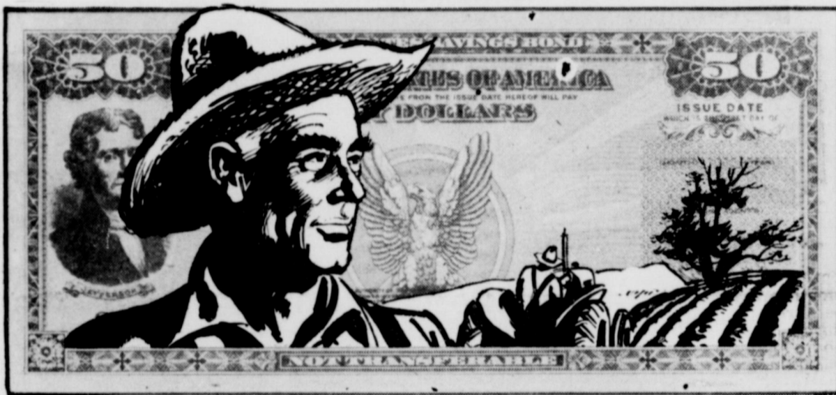
Money to insure that our productive power will thrive and grow. . . .