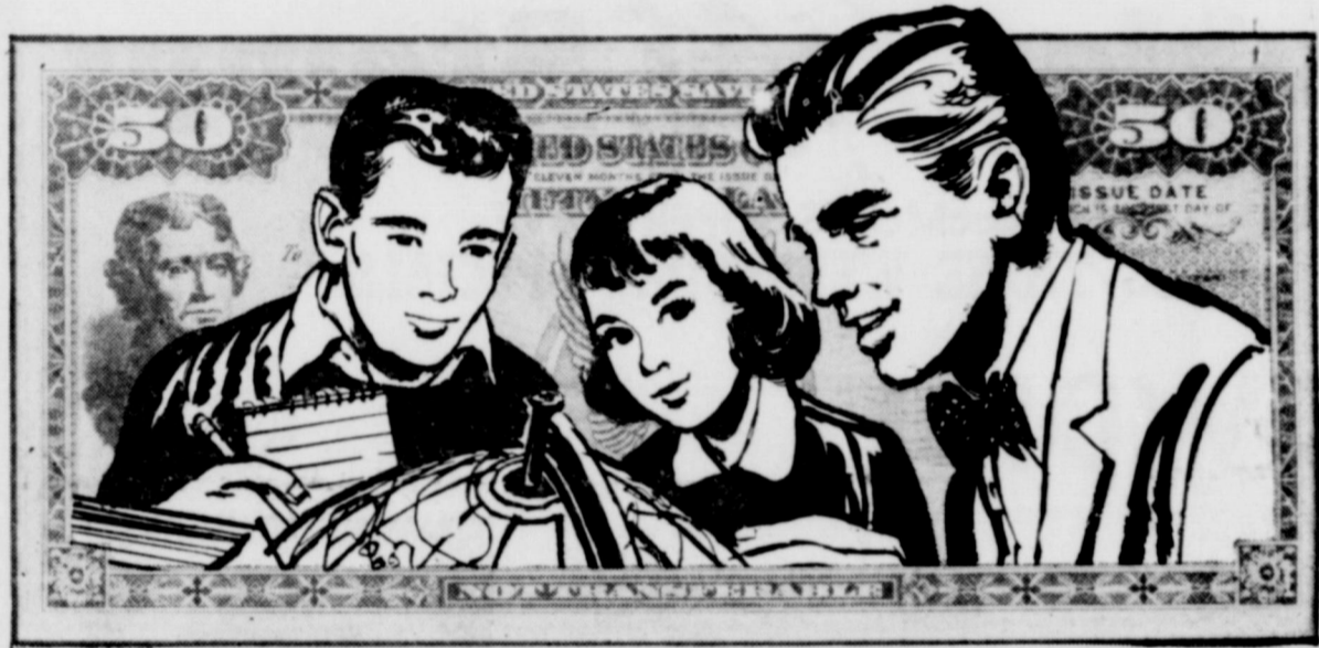
Money to help our children learn how to make peace lasting.

Yes; peace costs money. Money for research and schools and military preparedness. Money saved by individuals to keep our economy strong.