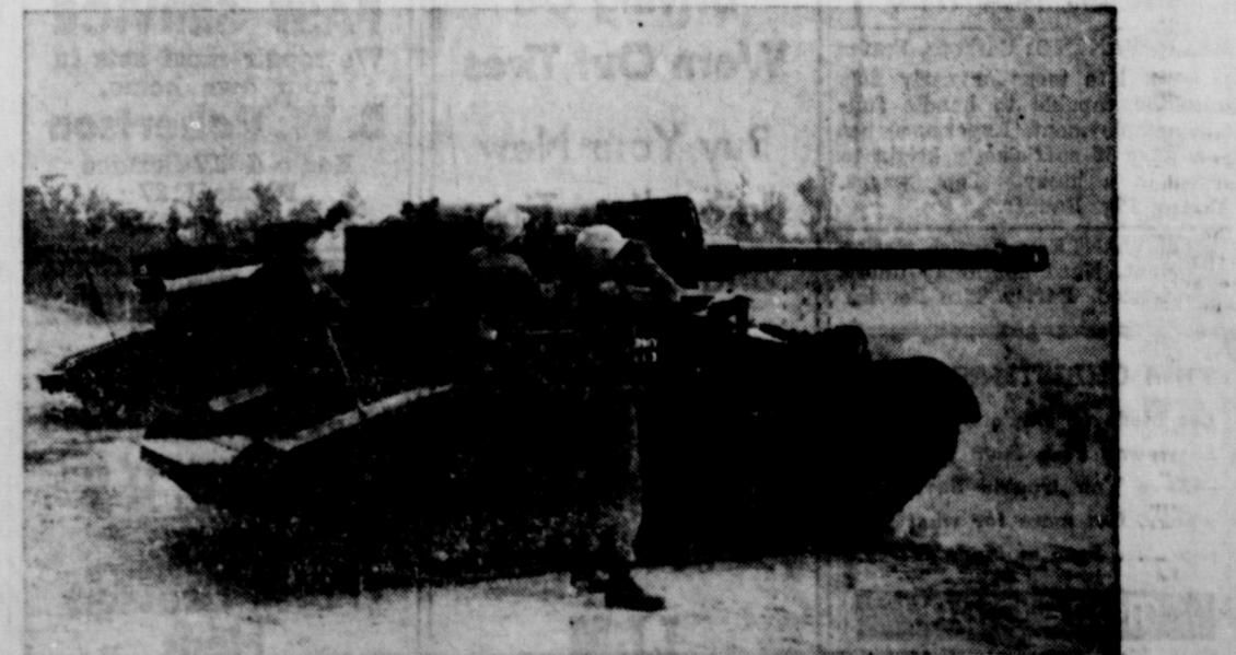
"SCORPION" STINGS—A 90-millimeter shell casing is ejected from the Army's M-56 "Scorpion" assault gun as the gun commander, right, observes for the hit during firing practice at Fort Stewart, Ga. The highly maneuverable and mobile self-propelled weapon is capable of being transported in either heavy assault gliders or cargo aircraft. Its light weight of under eight tons enables it to traverse muddy or marshy terrain, snow or sand and also permits it to be air-dropped. Manned by a crew of three, it has a maximum speed of 28 miles per hour, and a cruising range of 140 miles.