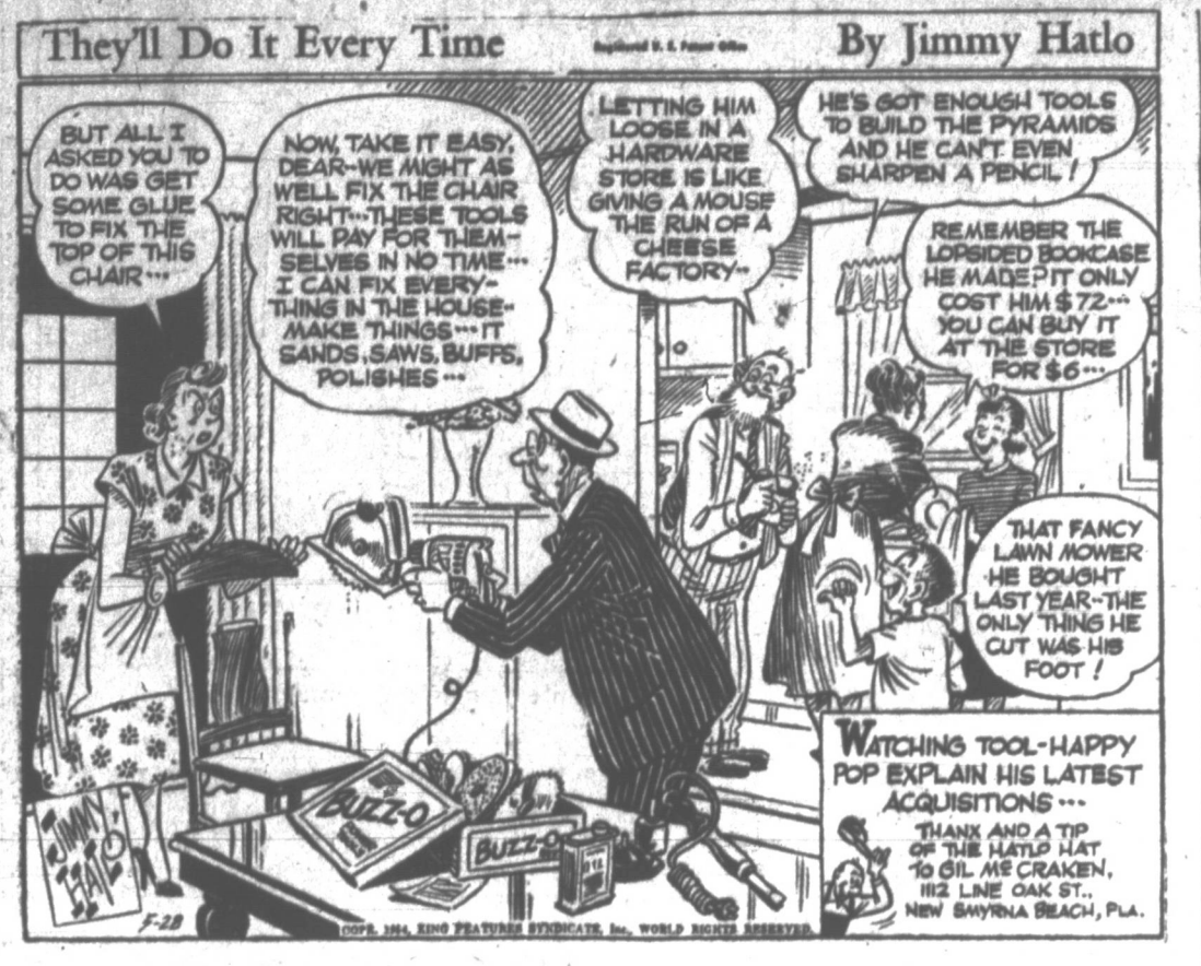
57 Good Things to Eat 57 68 Household Goods 68 69 Furnished Apartments 69

112 Farms - Tracts 112 Another Vacation Special This attractive Shoreline Beige over Saddle Brown Two Ten 4 door is equipped with Powerglide automatic trans- mission and EZI tinted glass. Regular price on this brand new fully warranted Chevrolet is $2280.21.