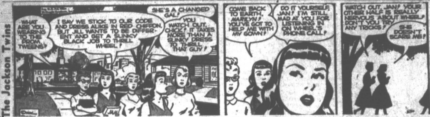
The Jackson Twins