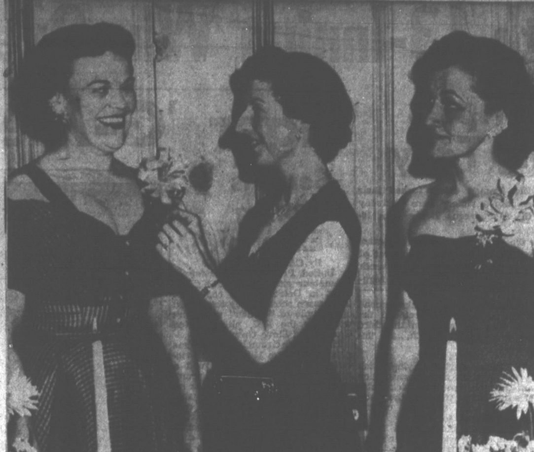
JEWELLED PIN CEREMONY - Epsilon Sigma Alpha sorority held jeweled pin and pledging ceremonies during a dinner meeting Thursday evening.