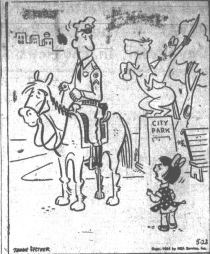
"Couldn't you afford a motorcycle?"