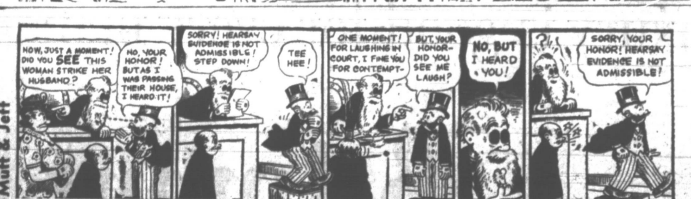
Mutt & Jeff