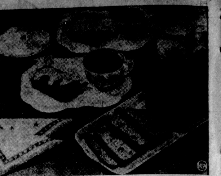
ELECTION DAY CAKE. In the New England tradition, features donkeys and elephants made of hard sauce.