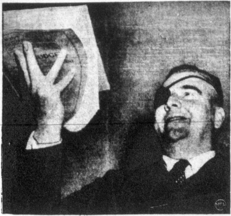
HARD TO BUDGE IT