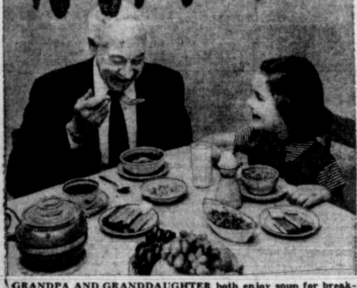
GRANDPA AND GRANDDAUGHTER both enjoy soup for breakfast. Nutritious, it helps break breakfast monotony.