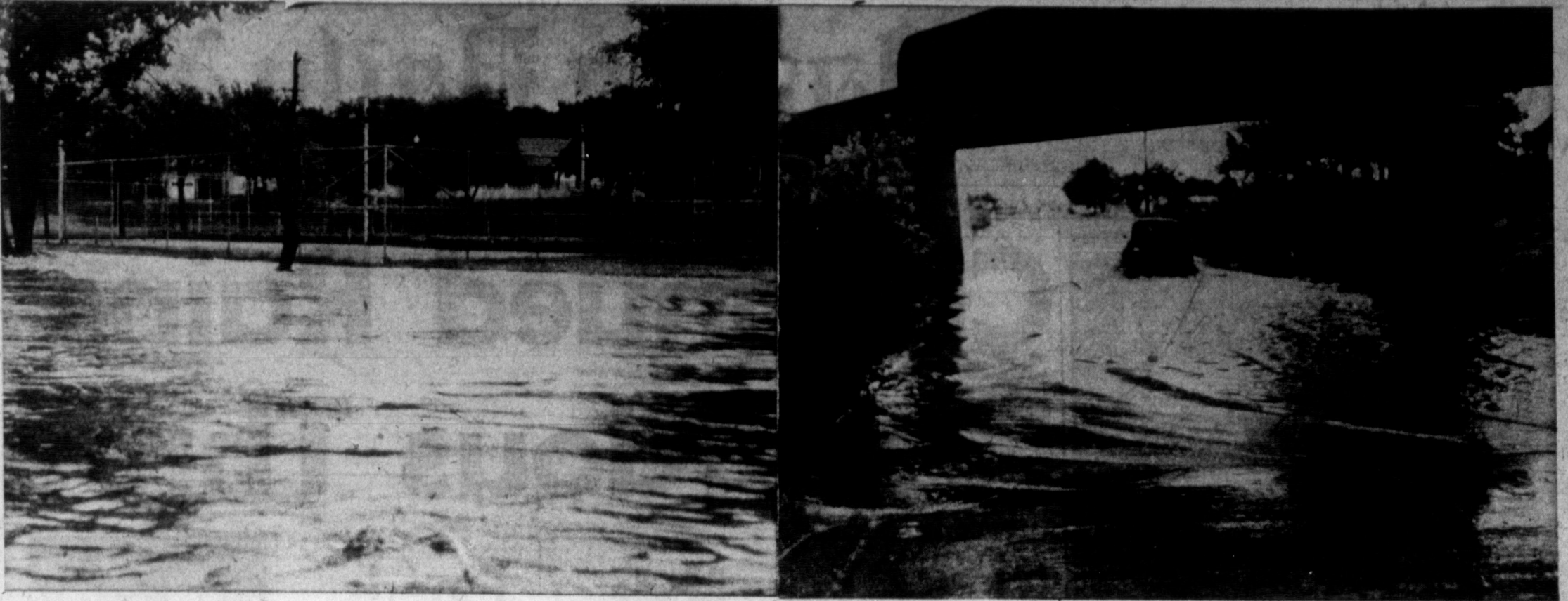
WATER WATER WATER

Pampa and vicinity has received more than its share of the rain for the month of May with a total of seven inches with 3.30 inches falling yesterday for a total of 5.0 for the past three days. With the abundance of rainfall, scenes like those above are becoming commonplace. The left was taken at the Canadian River Bridge yesterday at 10 a. m. The river at that time was up approximately 2 1/2 feet. The center photo shows a scene which Pampans have not seen since 1951. The water in Red Deer Creek is about to engulf the tennis courts in central park. In the right picture a pick-up truck eases through the mass of water gathered at the underpass on the Lefors highway. Traffic was detoured for several hours yesterday.