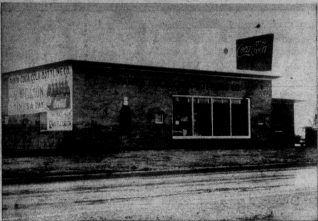
NEW COKE PLANT -- This is the new Coca-Cola plant on North Hobart where an open house will be held this week end. Twelve prizes will also be awarded during the course of the open house.