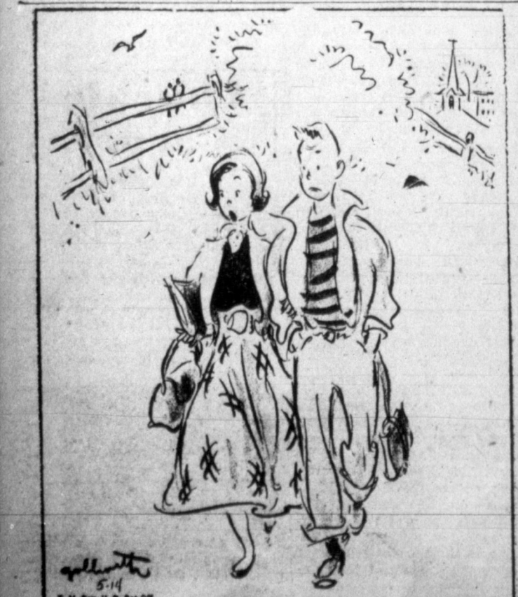
"If we can't marry till you're a doctor, that's a long time—what about that cowboy idea you had when we were freshmen?"

Curry powder is a blend of 16 different spices. They include turmeric, ginger, black pepper, cayenne pepper, powdered cloves, powdered caraway seeds, powdered cardamon seeds and powdered coriander seeds.