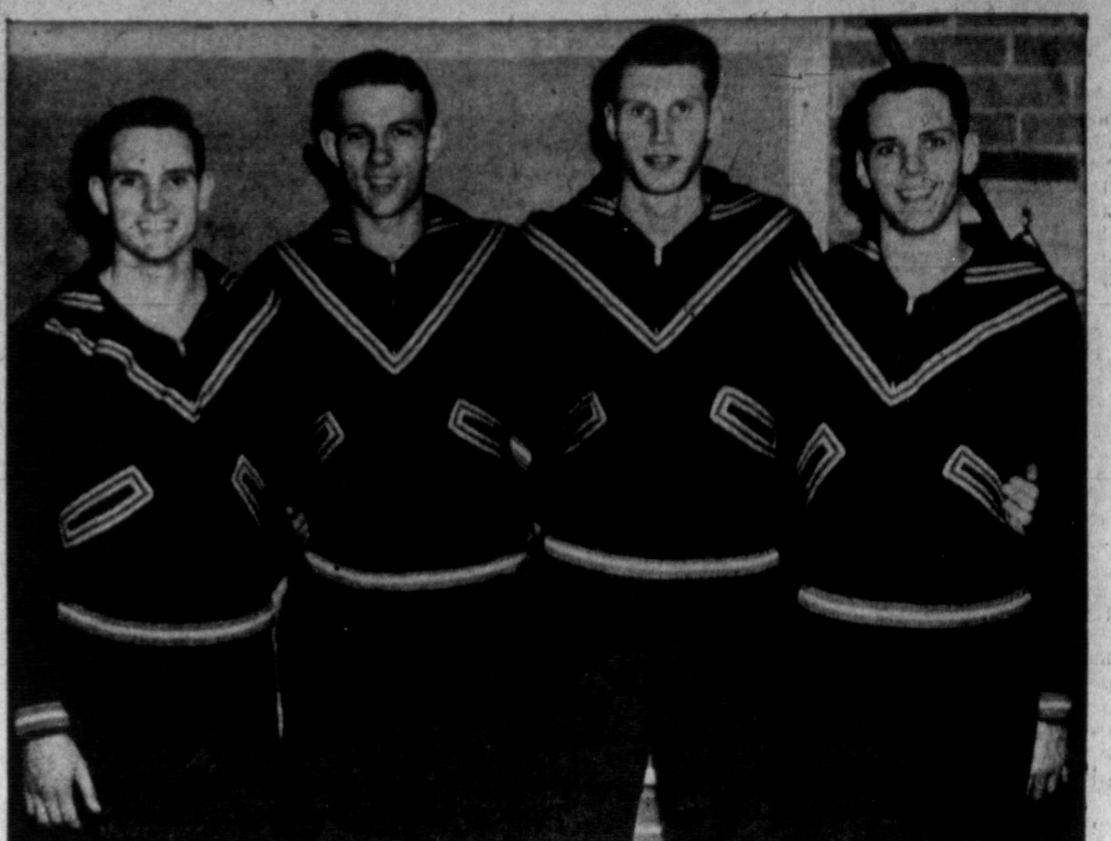
IN FINAL HOME APPEARANCE -- Shown above are four of the five starters for the 1954-55 Harvester basketball team who'll be in the "Exes" lineup tonight against the "Futures" at Harvester Fieldhouse...