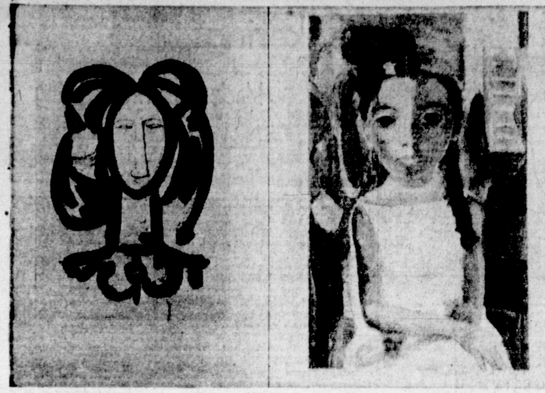
CONTRAST IN STYLE — Different styles of modern art are reflected in these two works from the art exhibit opening today at the "Little House"...