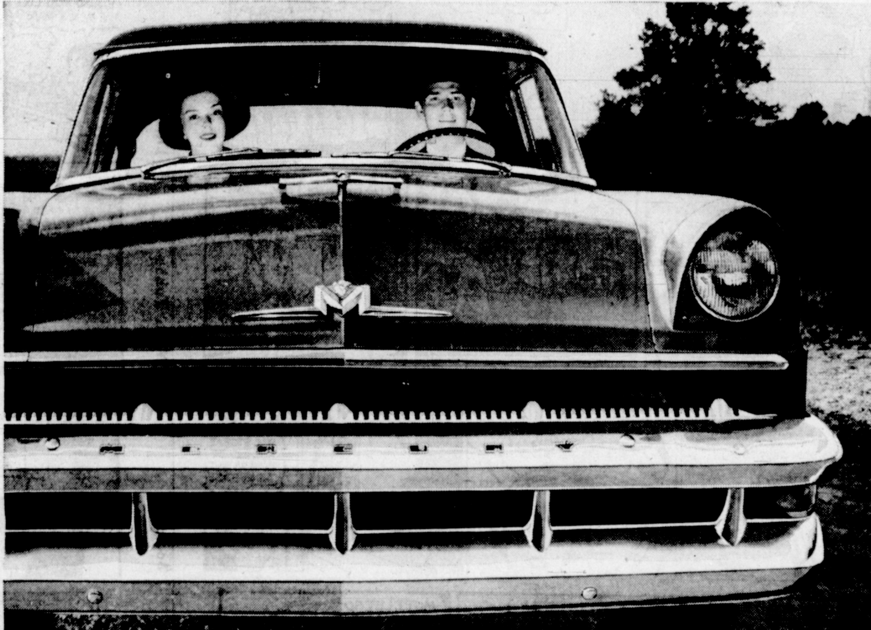
The new Medalist—a smartly styled 2-door, 6-passenger sedan.

So big — so powerful — yet this BIG M is priced with the lowest!