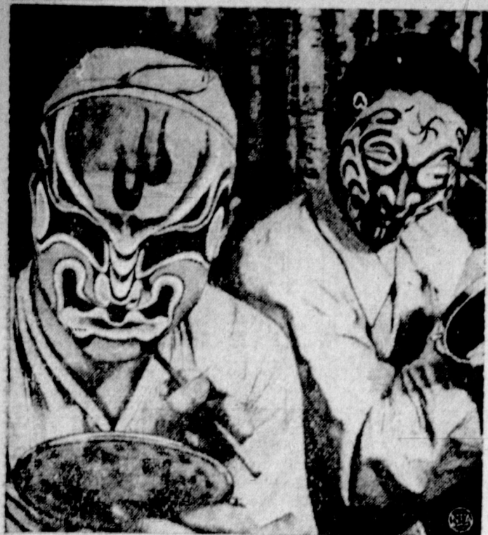
SELF PORTRAITS —Not enthusiastic Halloweeners, these members of a Chinese theatrical group are painting their faces for a show in Rome, Italy. They're part of a Chinese ballet group which also sings, acts and performs acrobatic feats. The facial make-up of each member plays an important part in the group's act.