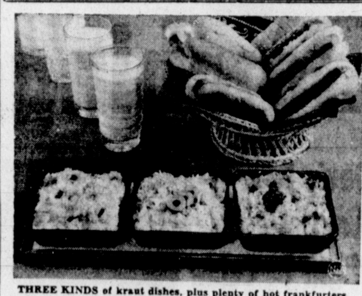
THREE KINDS of kraut dishes, plus plenty of hot frankfurters, will give those "do-it-yourself" feeders plenty to work on.