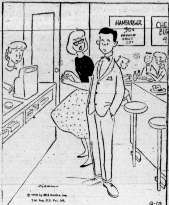
"One of these days you'll depend on my mad money and I won't have any!"