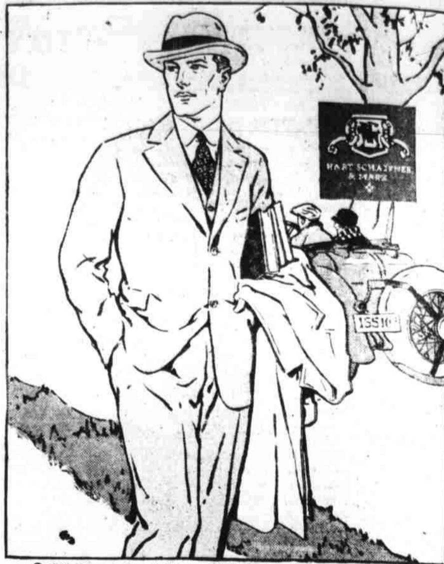
© 1925 Hart Schaffner & Marx