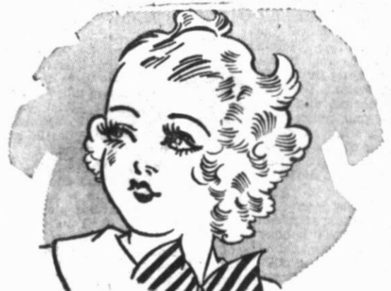
BOOTS —America's most popular girl—famous blond heroine of "Boots and Her Buddies," who, with her many "Heart Throbs," and girl friend, Babe, and the other gay and rollicking boy friends, comes to entertain you every Sunday.

BEGINNING NEXT SUNDAY JANUARY 3rd IN THE PAMPA DAILY NEWS