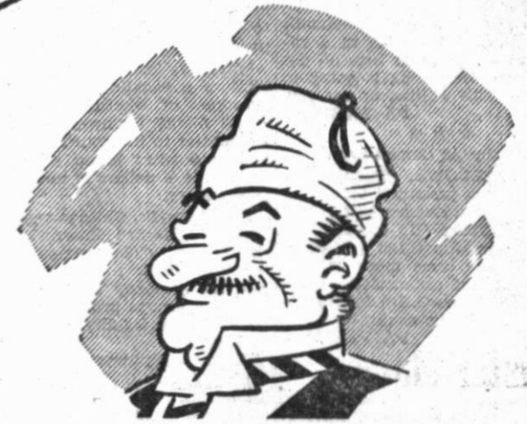
MAJOR HOOPLE, HIMSELF —in "Our Boarding House"—soldier, Olympic champion, explorer, author, inventor, diplomat, baseball, football, swimming expert, playmate of royalty, charter member "Brain Trust," man-about-town, man of leisure.