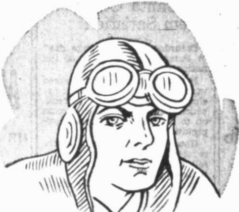
MEET TAIL SPIN TOMMY —Ace pilot and master of the air, who, with his pals, Skeets and the lovely Betty Lou, write history as they roar across the skies. These characters thunder through the greatest story of mystery ever conceived.