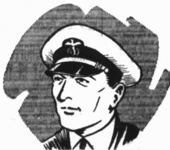
DON WINSLOW, U. S. N. —ace secret operative of a mighty nation, who flings discretion to the winds in his determined onslaught on the Scorpion's Oriental stronghold. Then, too, you'll meet Kai Foo, alias "The Icon."