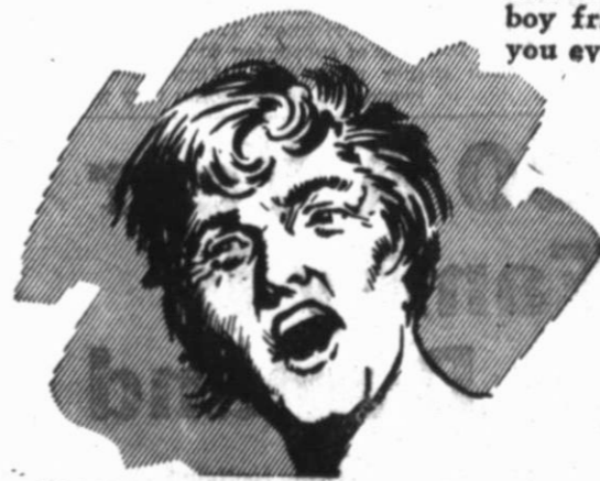
TARZAN —fearless fighter of the tropic forests—master of all their folk—swings into a new and absorbingly tremendous series of adventures, wherein savage strength and native cunning come to grips with civilization's most murderous weapons.