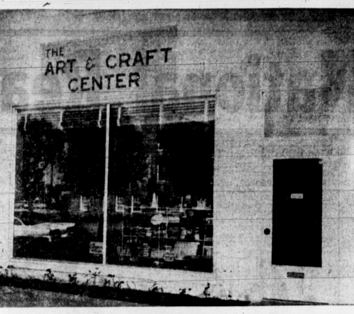
ARTS AND CRAFTS — For a complete line of materials and supplies for any art or hand craft, visit the Arts and Crafts Center, 204 N. West.

Simply paint on whatever type wood you prefer — (complete with the grain), maple, walnut, oak — you name it.