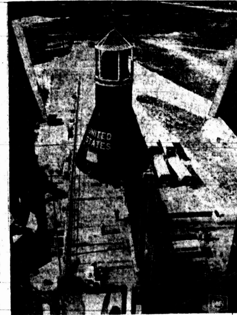
CAPSULE CAPPING —Astronaut L. Gordon Cooper's Mercury capsule, "Faith 7," is carefully hoisted for placing atop its Atlas booster at Pad 14 at Cape Canaveral, Fla. When the escape rocket is attached to the nose of the 2,500-pound capsule, the entire Atlas-Mercury will tower 85 feet.

Rumors Are Absent Missing even was the usual epidemic of postponement rumors that normally sweep through the tide of newsmen who have poured into the area to cover the launching. "It looks so good I'm really getting a bit worried," said one.