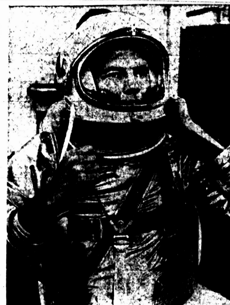
FLIGHT FEDORA —America's sixth Mercury astronaut L. Gordon Cooper tries on the helmet he will wear for 34 hours in space during his 22-orbit flight in the "Faith 7" capsule. Closing the helmet's visor actuates a valve to inflate an airtight seal around the visor.

CAPE CANAVERAL (UPI) — Scientists moved ahead confidently today with plans to send astronaut L. Gordon Cooper on America's most ambitious space journey Tuesday despite a threat of bad weather.